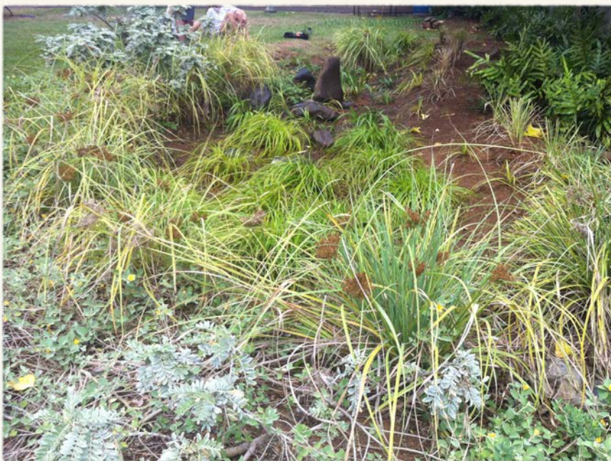
Mature vegetation at He'eia State Park's rain garden:

Project grant funds for the manual and cost share program come from the U.S. Environmental Protection Agency and the State of Hawai'i, Clean Water Branch, Polluted Control Runoff.