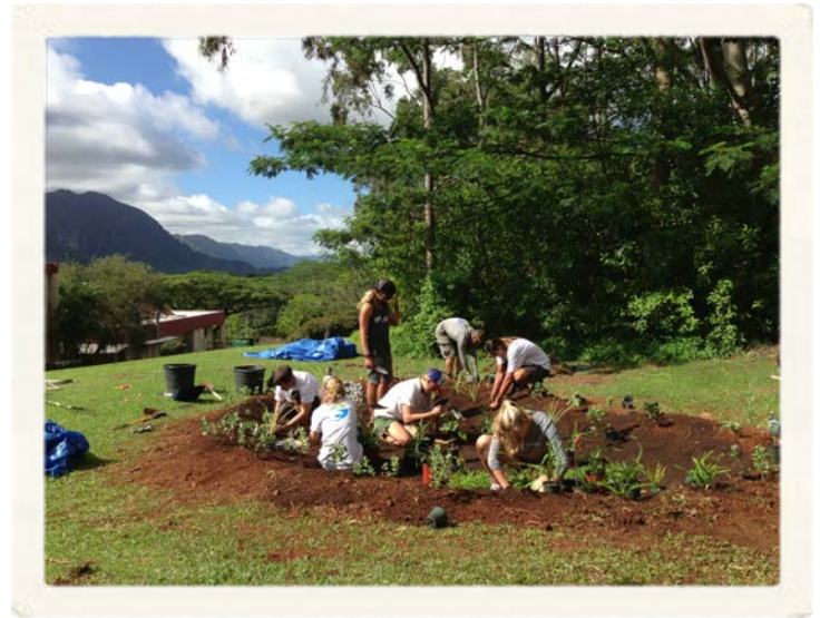
Students from Hawaii Pacific University's Natural Resource Management program plant native vegetation at a recently built rain garden at their campus.

If you are interested in learning more about the cost share program or having a rain garden training for your group, contact Todd Cullison at 808-277-5611 or tcullison@hawaii.rr.com . You can learn more about rain gardens on HOK's website at, www.huihawaii.org/raingardens.html . You can also visit He'eia State Park to view a recently constructed rain garden.