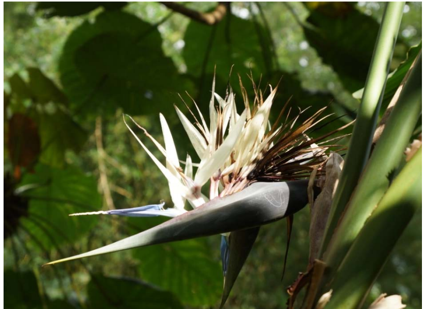
Bird of Paradise and ginger blooms are example of bird pollinated flowers that are not meant to feed insect pollinators.

It is possible to add bee friendlier flowers by adding either potted plants or planting shorter species between the taller ones that already exist. Creating "strata" or layers in a garden can increase visual appeal and allows for greater floral diversity in a small space.