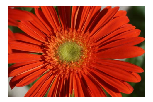
Gerbera, an ornamental plant in the daisy family, is an example of a flower shape that is easily accessible to most insect pollinators. The close up photo (right) shows that what appears to be a single flower is a collection of very small individual disk flowers that produce nectar and pollen.

Most bees and pollinating flies will visit short corolla flowers and daisy type flowers (Family Asteraceae) in which they can easily access nectar and pollen.