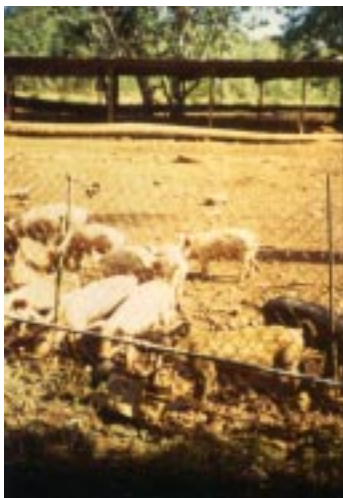
Pigs in the sun are easily heat-stressed

Following are seven economical methods to keep pigs cool and to maintain healthy and happy pigs.