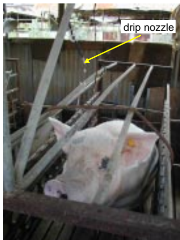
Drip cooling a sow

hose with a drip nozzle is suspended over each farrowing crate in a position that allows water to drip slowly over the sow's neck and shoulder area. Evaporation of the water has a cooling effect, making the sow more comfortable and reducing heat stress. A temperature-activated electronic device can be used to control the water flow.