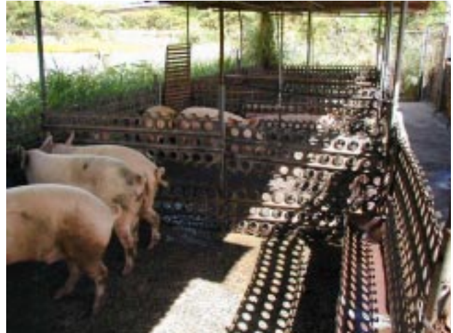
Openings in pens allow air movement to keep pigs cool