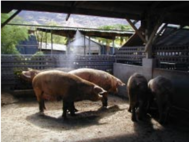
Pigs enjoy the cooling provided by a sprinkler