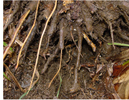
Figure 2. Roots of plant toppled by burrowing nematode. The cortex of most roots has been eaten away leaving the thin, white stele.

plants with needed water and nutrients. This can slow plant growth, lengthen the time to fruiting, reduce bunch weight, and decrease the productive life of the farm. Top-heavy plants may fall over due to the loss of anchoring roots (Fig. 2).