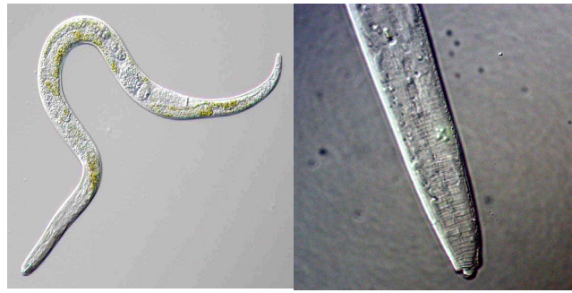
Figure 6. A lesion nematode, P. gibbicaudatus , and its distinctive tail.

Root knot nematode, Meloidogyne sp. was found on three farms, but root damage was minor.