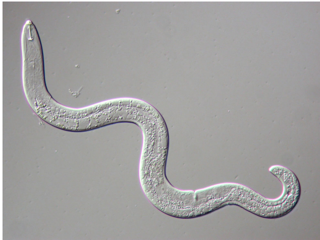
Figure 1. A typical plant-parasitic nematode. Note the spear-like stylet.

Nematodes are small, worm-like members of the animal kingdom from 0.5-1.0 mm in length (Fig. 1). They are found in almost every habitat, in fresh or salt water, and in soil. Most feed on other microscopic organisms, but some parasitize animals and humans (filariasis), and several hundred species attack plants. Plant-parasitic nematodes have stylets, spear-like mouthparts that pierce cells and allow nematodes to feed on their contents.