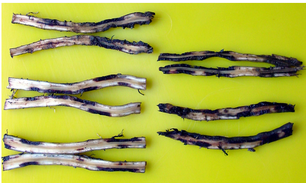
Figure 5. Reddish-black necrosis of root cortex caused by R. similis .

Burrowing nematode ( Radopholus similis ) is the most damaging nematode in banana producing countries. It is an endoparasite, completing its entire life cycle within the root and causing decay of the whole root cortex (Fig. 5). Radopholus similis is a common cause of banana plants falling over, a condition known as “toppling disease” (Fig. 2). This nematode can also burrow from the roots into the rhizome. The small black spots it creates are sometimes called “blackhead disease”.