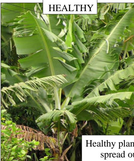
Healthy plants are wide open, spread out, and green.