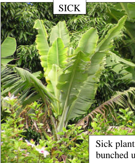
Sick plants look stunted, bunched up, and yellow.