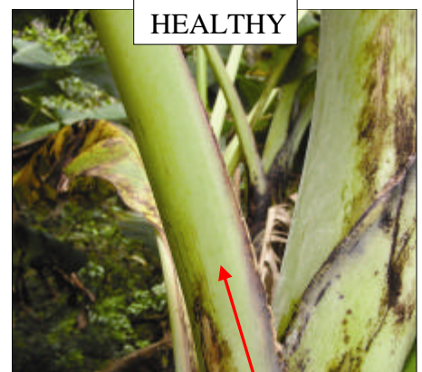
Healthy plants are clear near the middle of leaves and where leaves attach to the plant.