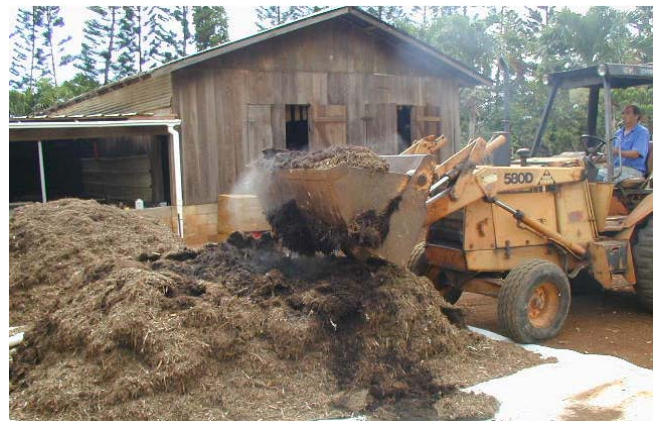
Turning the compost pile.

Safety of the composted product is important when applying it to vegetables, such as radishes, that are normally eaten raw. Both compost piles reached a temperature higher than 130°F for more than the 3 days needed to destroy disease organisms. Compost from both piles was negative when tested for salmonella bacteria, confirming its suitability for application on land used to grow vegetables.