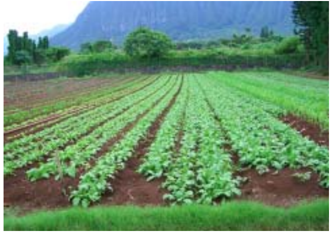
The test planting.

Frequent rains delayed land application of the compost and crop planting. Compost and soil samples were analyzed for nutrients at the UH-CTAHR Agricultural Diagnostic Service Center. Because soil phosphorus was adequate, compost application rates were based on estimated crop phosphorus removal. Compost was applied at 10 tons of compost per acre, or about 1/2 pound per square foot, and tilled into the soil. Compost application was compared with the farmer's standard commercial fertilizer application. The field was made into beds with each bed planted with two rows of radishes and one row of corn between them. The crops were irrigated following normal farm practice.