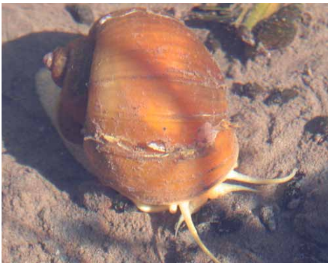
An apple snail, photographed under water

[These are small ones—they can be about twice this size]