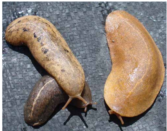
The Cuban slug comes in many colors.

[about actual size; photo: Robert Cowie]