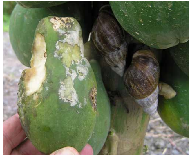
Giant African snails, and damage from their feeding

[These are small ones—they can be about twice this size; photo: Scot Nelson]