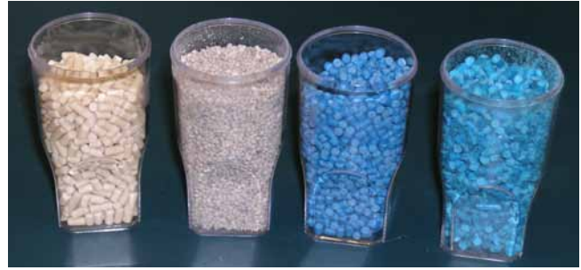
Various slug and snail baits

If you are growing potted plants on benches, or if you have fruit trees you wish to protect, physical barriers may be the most effective method of keeping your crop safe. Copper in various forms is repellent to slugs and snails, and these animals will generally avoid crossing a band that is 3–4 inches wide or greater. Copper foil can be placed around bench supports. Alternatively, bench supports or the trunks of trees can be treated with a sprayable formulation of copper such as Bordeaux mixture. The incorporation of latex paint into the mix will greatly increase the length of time that the material will stay repellent. Additional information on barriers and