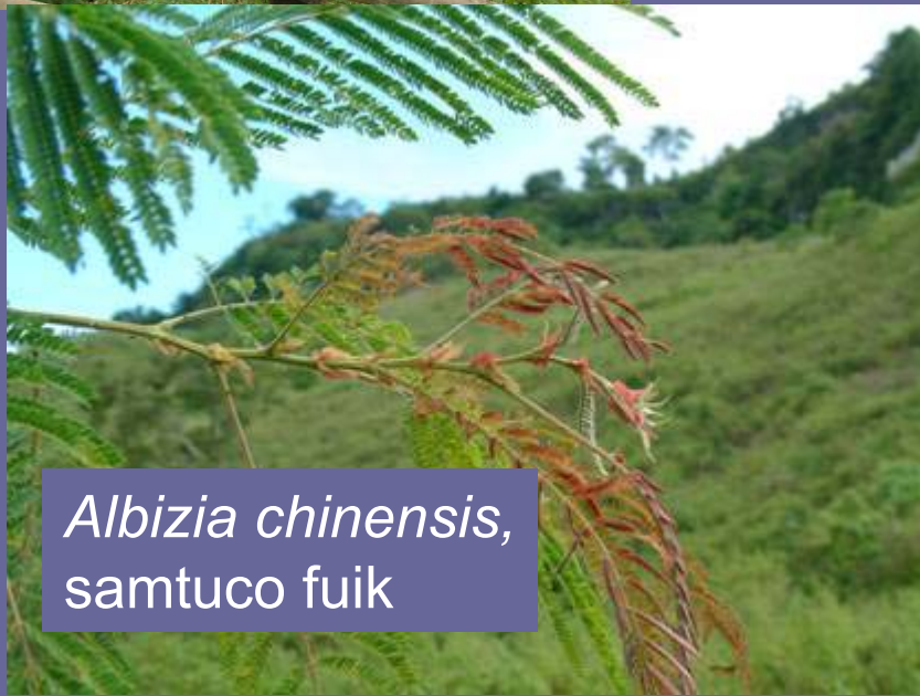
Albizia chinensis , samtuco fuik