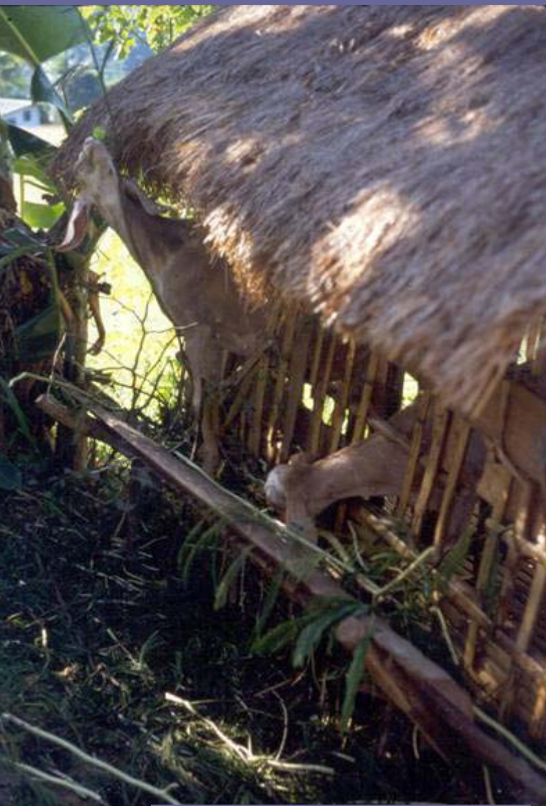
Calliandra as forage