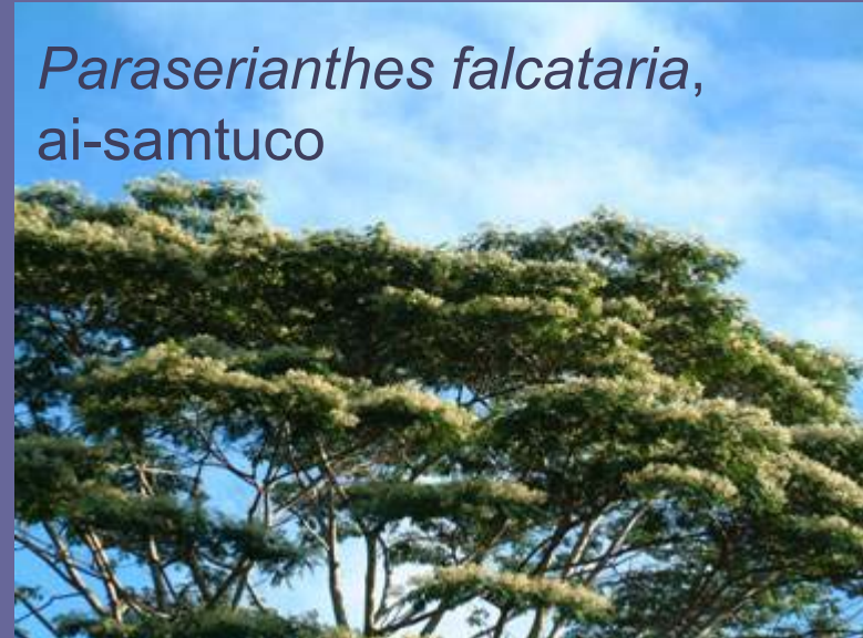
Paraserianthes falcataria , ai-samtuco