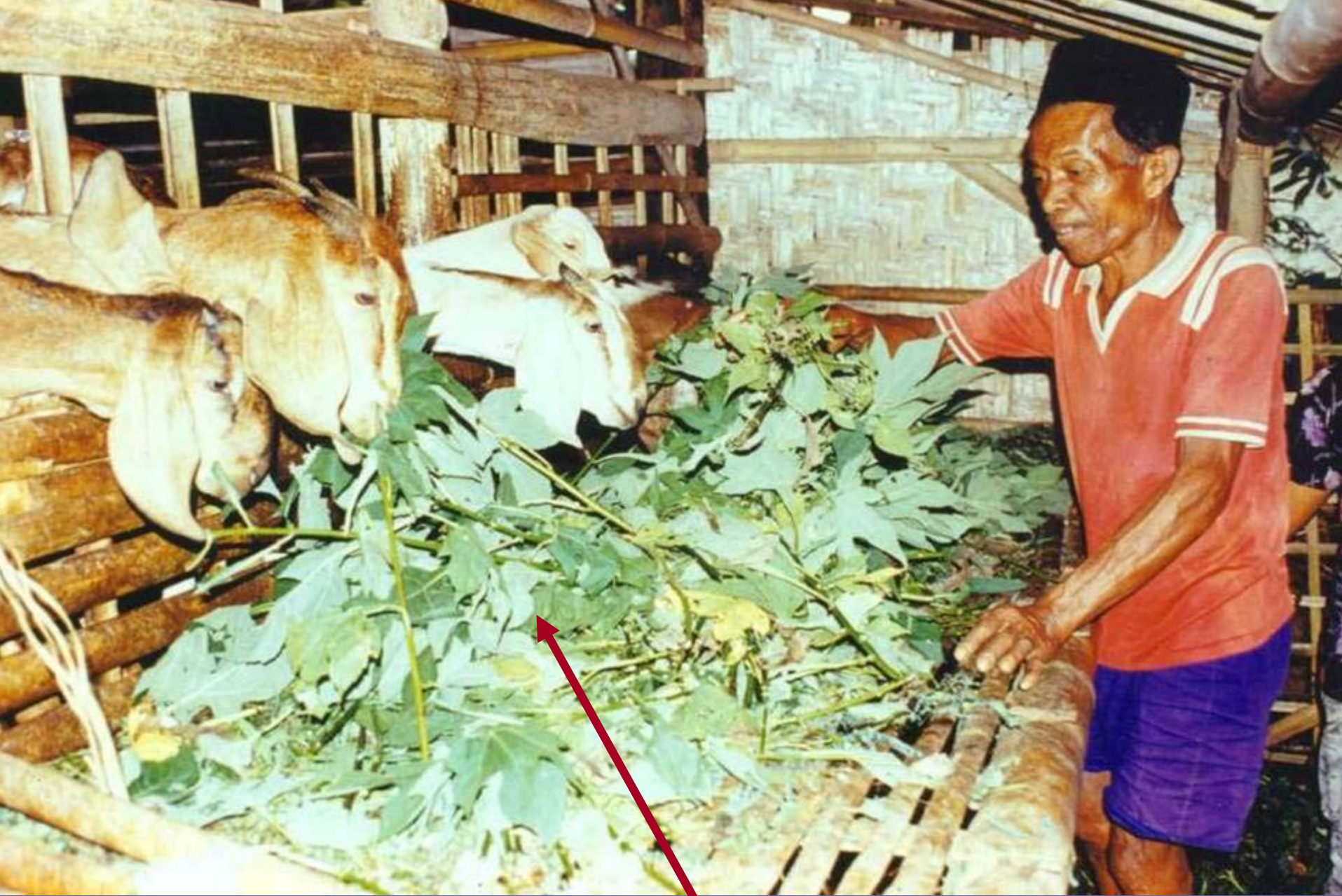
Tithonia (sunflower) ai-funan loro-matan hanesa ai-han ba bibi iha, Java