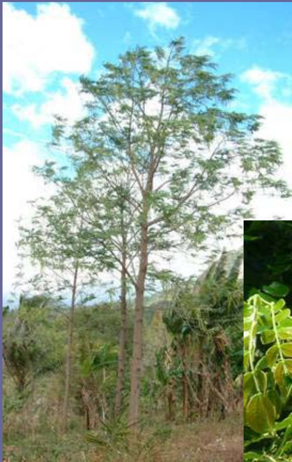
Sesbania , ai-turi

Ai-horis balu bele adapta atu bele hetan udan uit-oan no iha tempo udan bo'ot