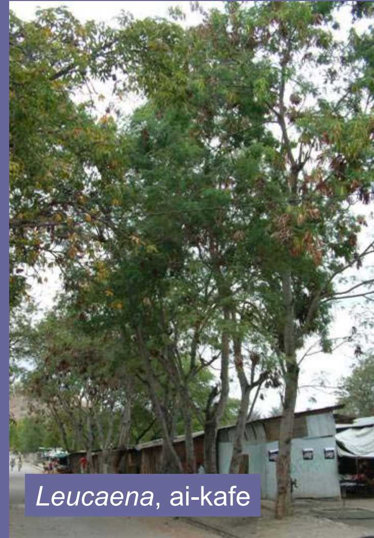
Leucaena , ai-kafe