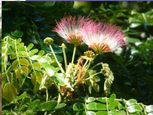
Samanea saman , ai-matan-dukur