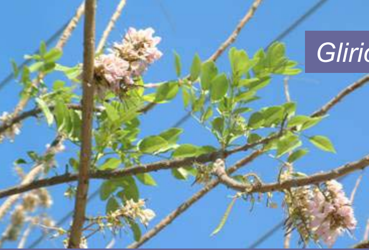
Gliricidia , gamal

Ai-horis balu bele adapta atu bele hetan udan uit-oan no iha tempo udan bo'ot