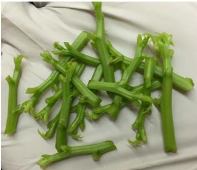
Figure 2. Papaya shoot-tips (5 cm long) ready for surface sterilization