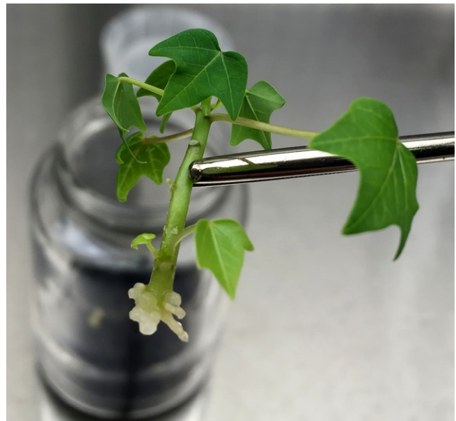
Figure 6. Healthy papaya root initials after 5 weeks in REM.

One-centimeter shoots that had been on RIM for