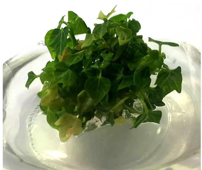
Figure 3. Multiplying clump from axillary buds on shoot multiplication medium (SMM).

One hundred multiplying clumps were transferred to shoot elongation medium (SEM) composed of 1.5X MS basal medium, 0.25 mg/l BAP, 0.3 mg/l gibberellic acid