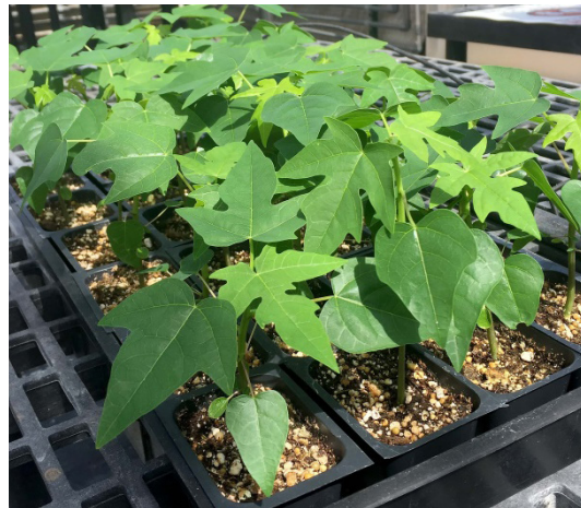
Figure 1. Two-month-old hermaphroditic 'Rainbow' papaya seedlings as source of explants

Planting seeds is the common means of commercial propagation of papaya, not only in the Hawaiian Islands but around the world (Patel et al. 2013). 'Rainbow', a commercially popular Hawaiian variety, is a transgenic yellow-fleshed Papaya Ringspot Virus (PRSV)-resistant F_1 hybrid which was released in 1998 (Manshardt 1998). 'Rainbow' seedlings segregate for sex, producing a 1:1 hermaphrodite/female (Storey 1938). To ensure a uniform stand of hermaphrodite plants in the field, five or more seeds are planted per hole, and then at sexual maturity (4–5 months after germination), surplus hermaphrodites and females are rogued, leaving one hermaphrodite per hole (Estrella et al. 2012). Overplanting adds to the cost of production as it causes early competition for water, nutrients, and