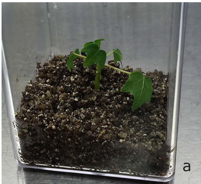
Figure 7a. Rooting in vermiculite; 7b. Well-developed root system.