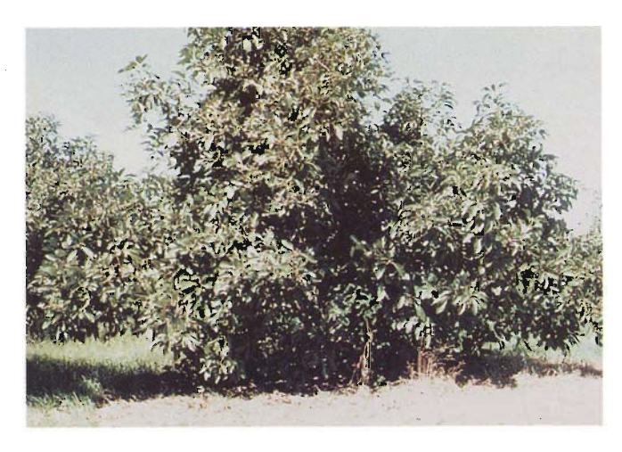
Fig. 1. 'Malama' tree.

'Malama' is a new, high quality, fall-ripening avocado ( Persea americana L.) cultivar developed by the Department of Horticulture, University of Hawaii.