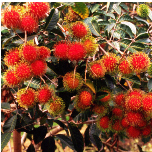
Rambutan, Nephelium lappaceum L.

Skin and spine coloration is the main horticultural maturity index. Fruit having green skin and greenish-red spines are sour. Fruit have both skin and spines red or yellow, depending upon variety. Between these two stages, sugar content increases about 20%, and acid levels are half those at the green stage (Mendoza et al. 1982). The acceptable stage