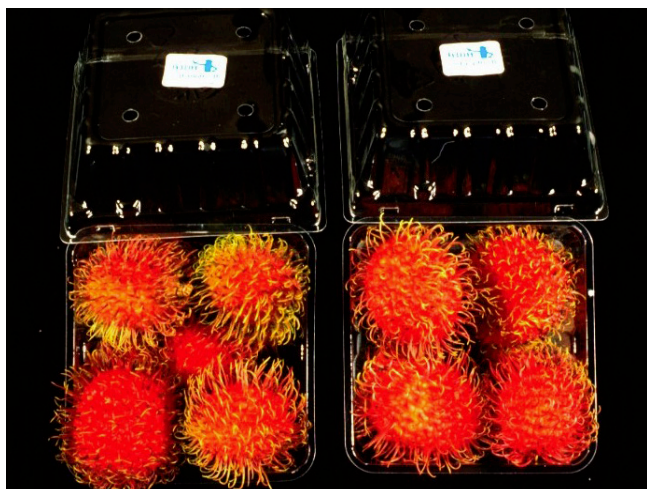
Rambutan in punnets (above), loose rambutan for sale (top).