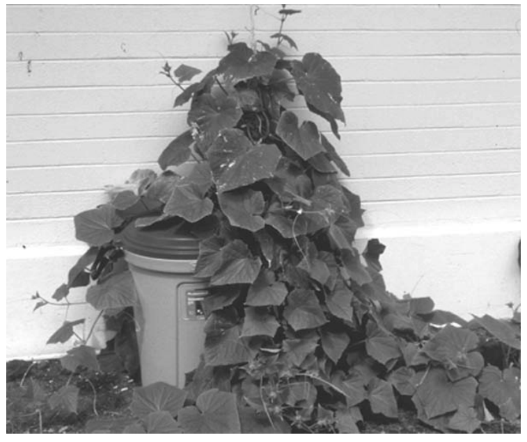
A vigorous cucumber plant growing in a plastic trash container. Pumps and electricity are not required. No additional water or fertilizer is needed beyond the initial set-up.

Then, fill the container with water to about 1 inch from the top. Stir the nutrient solution (water plus fertilizer) again.