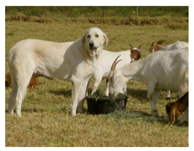
Figure 11. Guard dogs, like this Akbash on Maui, are playing an increasingly important role in protecting herds against losses to pigs, dogs, and thieves..

How much space goats need again depends on many factors, but primarily the forage productivity of a site through the year. You can estimate annual forage demand based on the average amount a goat eats-2.8% of its body weight DM everyday. So the question to ask yourself is how much do 30 does (or 60 with one helper, 90 with two helpers, etc.), weighing on average 90 lbs.