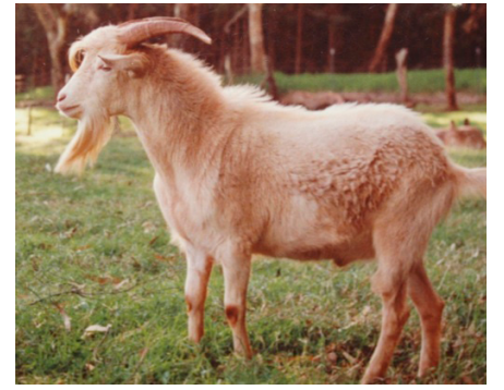
Figure 2. Kiko goat on Maui.

Any agricultural production system, whether pursued as a hobby or for profit, begins with a clear and explicit statement of goals. In making production goals, start with an end in mind: If you had 10 to 15 market-ready goats today, what would you like to do with them? What would you need to do with them? Specifically, to whom would you sell them? What is the market asking for? Can you meet this demand consistently in quantity and quality? Do you have adequate resources, or are you willing to get them? Are you willing to invest and do what it takes to meet this market? Figure 5 can help guide you through the goal-making process. For more on effective goalsetting, see "Goal Setting by Farm and Ranch Families" by Doye (1990), available at http://pods.dasnr.okstate.edu/ docushare/dsweb/Get/Document-1674/F-244web.pdf.