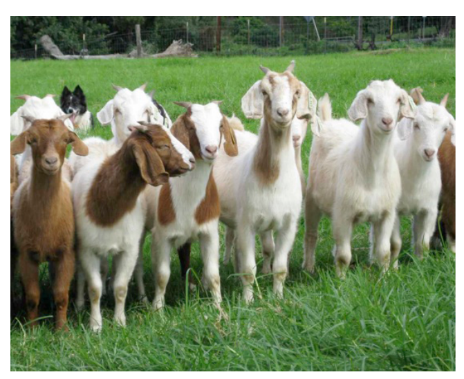
Figure 1. Replacement doelings on Maui.

The purpose of this publication is to provide general guidelines and considerations for those interested in or currently raising goats on a commercial scale or