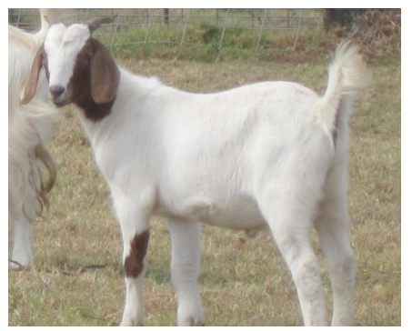
Figure 4. Boer cross goat (Photo courtesy Haleakala Ranch).