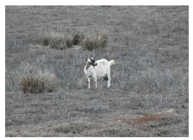
Figure 6. Despite being on drought-stricken range on Maui, this doe is pregnant and maintains full udders. Goats are an excellent animal for droughty areas or extensive production practices.

The following section describes common health problems in meat-goat herds in Hawai'i. Many other health issues can also be a concern, and any omission here of particular issues is not meant to indicate that they may