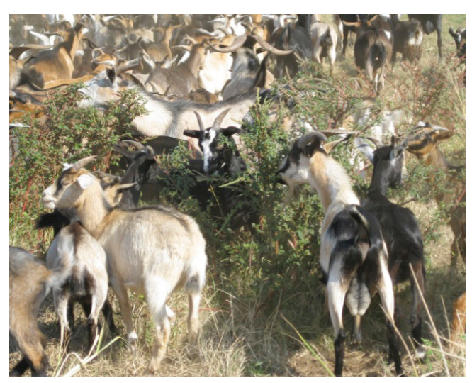
Figure 10. Big Island goats used primarily for weed control. In this case they are eating spiny amaranth ( Ama ranthus spinosa ).

To make more efficient use of pastures by multispecies stocking, Haleakala Ranch has tested "livestock bonding" methods to pair up cattle, sheep, and goats. Based on the work of Dr. Dean Anderson of the USDA Agricultural Research Service and other researchers, the ranch is testing whether bonded animals will use the pastures more uniformly and be easier to manage than non-bonded animals. While the ranch uses guard dogs, USDA researchers in New Mexico found that sheep and goats will hide among cattle when threatened by predators rather than running off and getting singled out. A brief video produced by the CTAHR Cooperative Extension Service documenting Haleakala Ranch's bonding work can be viewed at http://www.youtube.com/ watch?v=ywhB40DFQsQ.