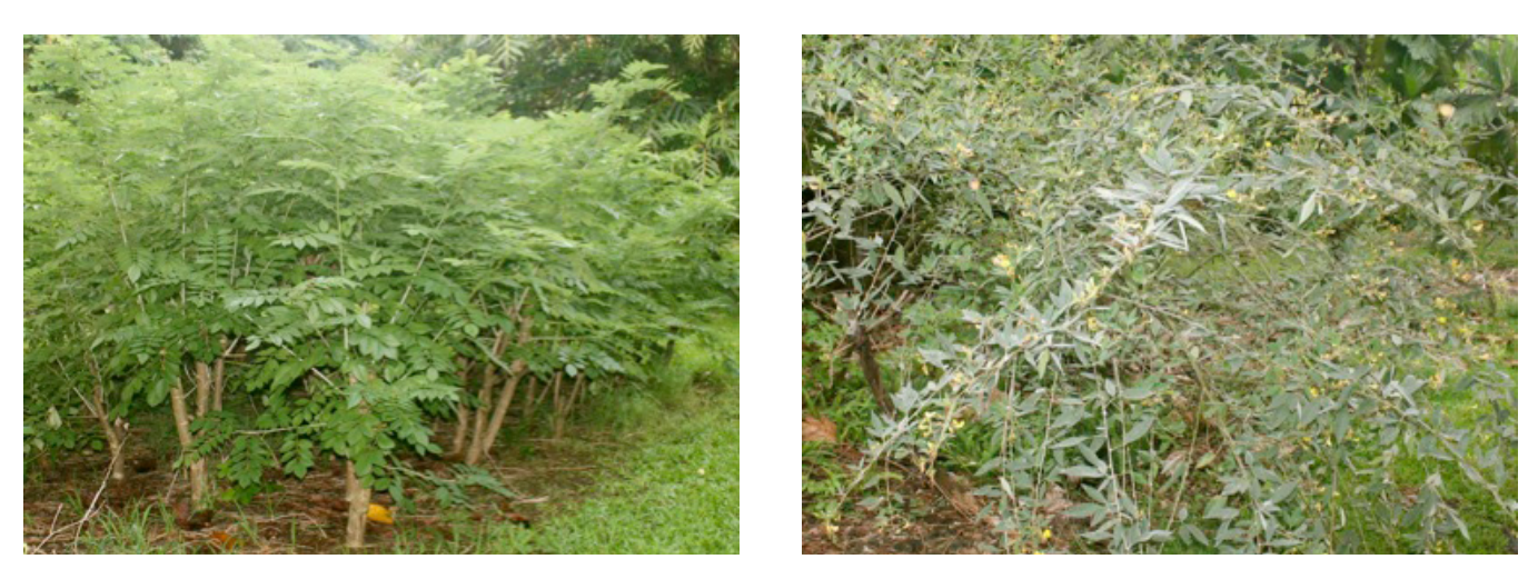
Figure 9. Gliricidia (left) and pigeon pea (right), among others, are shrub species that can add to the quality and quantity of forage in your pasture and encourage goats' natural preference for browsing.

Individual marketing schemes depend heavily on reputation, consistency, and quality of supply. Marketing