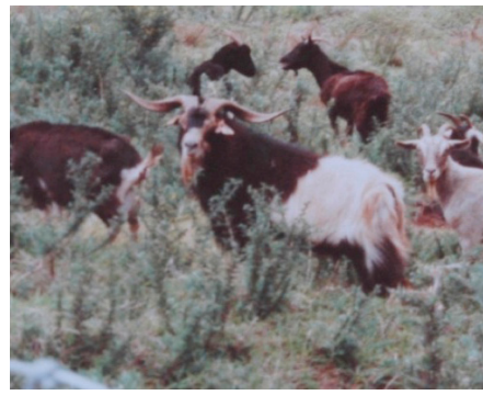
Figure 3. Spanish meat goats on Maui.