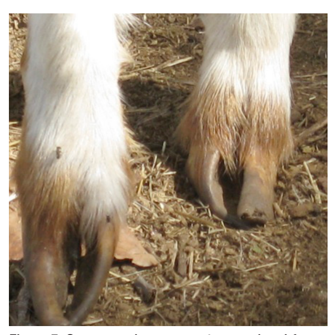
Figure 7. Overgrown hooves can trap mud and feces, leading to an inflammation called foot scald. Monitor for lameness and treat as appropriate. Rocky areas in a pasture or access to pavement tend to help goats maintain their feet in good condition.

Kid health: At birth, tie off umbilical cord and dip in iodine solution to prevent infection, especially if kidding in pasture. Make sure kids get at least 2 ounces of colostrum in the first 24 hours after birth, as this is their