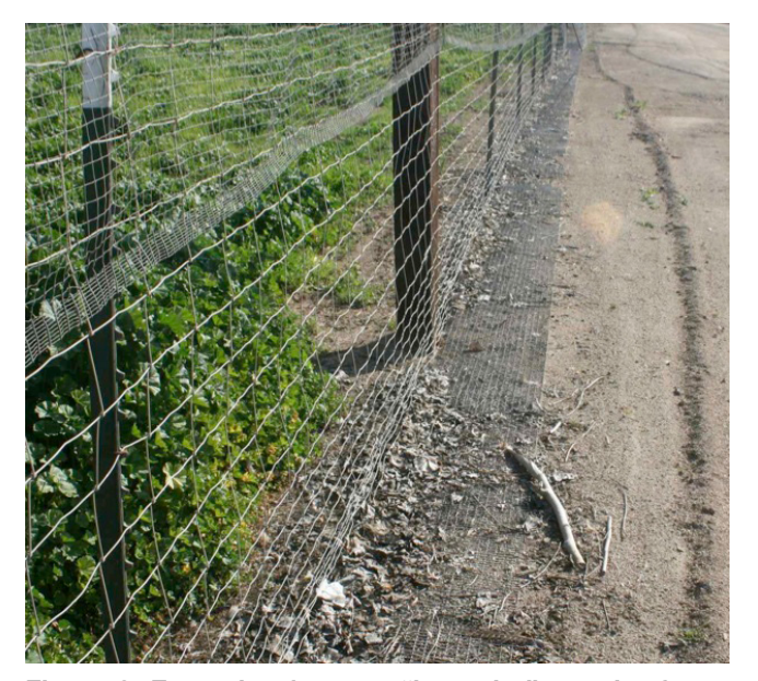
Figure 8. Example of woven "hog wire" exterior fence with a cage wire skirt to prevent digging under. Others will use barbed and/or electric wire along the bottom to prevent burrowing.