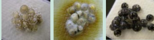
6 days after treatment: eggs sprayed with 16% citric acid (left) or 3% hydrated lime (middle) have died and are covered with mold, compared to untreated eggs with visible embryos developing (right).

HOW THEY WORK: Both hydrated lime and citric acid are corrosive and burn the skin of the frog, interfering with its ability to breathe. Either solution requires direct contact with frogs or eggs and does not have significant residual (long-lasting) effects. Frogs and froglets usually die within a few minutes; treated eggs absorb the chemical and do not hatch. Hydrated lime (high pH) and citric acid (low pH) should not be mixed together because they will neutralize each other and be ineffective.