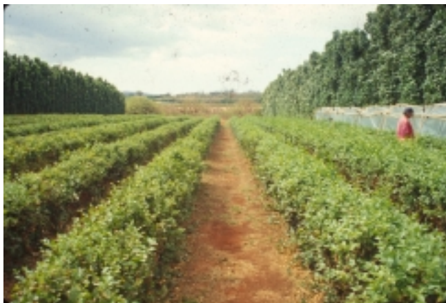
A pikake planting protected by windbreaks of ‘Tropic Coral’ erythrina. Above, before pruning; below, a pruned row.

plished by scheduling pruning. Plants will flower approximately 30 days after pruning in summer, or 40 days in the cooler months of the blooming period. The response time may differ from one location to another. Careful growers keep a log to record the dates of pruning for each row and the dates of the following flowering flush, then they use this information to fine-tune flowering manipulation for their particular conditions. A recommended practice is to prune a section of the field every week to achieve constant production.