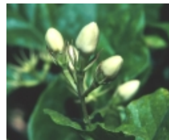
Buds on the branch terminal.

maximum amount of perfume. During the winter, particularly during “kona” weather, harvesting is delayed until midday, allowing the buds more time to mature. Buds must be white before they are harvested. If they are harvested too young (light creamy green-yellow) they will not open and emit the typical fragrance for which pikake is known. The buds are harvested on the basis of color rather than size or firmness, because bud size and firmness depend on the weather conditions during bud development.