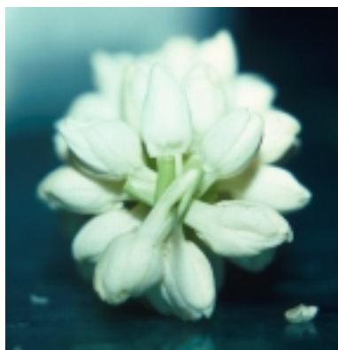
Pikake buds strung crosswise, forming a "rope" lei.

Jasminum sambac , from the olive family (Oleaceae), is a native of India. It is a fragrant-flowered shrub, 2–3 feet wide and up to 6 feet tall, that is fairly hardy and drought resistant. It has a moderate growth rate in spring and summer but grows slowly during cool seasons. It has downy branches bearing rich green, rounded to oval, paired leaves with prominent veins. The plant has both bushy and viny growth characteristics. The ½–¾-inch cream-white flowers are borne at branch terminals either singly or in clusters on new growth. The unopened bud is oval, and the open flower is star-shaped.