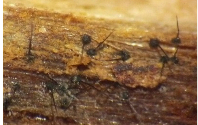
Figure 6. Close-up of perithecia, or sexual fruiting bodies, of Ceratocystis on diseased 'ōhi'a wood.

For more information and updates on research on Ceratocystis wilt of 'ōhi'a, see http://www.ohiawilt.org or scan the QR code.