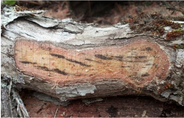
Figure 5. Bark slash of an 'ōhi'a tree showing tangential view of dark staining of sapwood from Ceratocystis infection.

Currently, there is no known method of protecting 'ōhi'a trees from becoming infected with Ceratocystis nor an effective treatment to cure trees that exhibit symptoms of the disease. To reduce the spread of Ceratocystis , landowners should not transport wood of affected 'ōhi'a trees to other areas. The pathogen may remain viable for over a year in dead wood. Tools used for cutting infected 'ōhi'a trees should be cleaned either with Lysol™ or a 70% rubbing alcohol solution. A freshly prepared 10% solution of chlorine bleach and water can be used as long as tools are oiled afterwards, as chlorine bleach will corrode metal tools. Chainsaw blades should be brushed clean, sprayed with cleaning solution, and run briefly to lubricate the chain. Vehicles used off-road in infected forest areas should be thoroughly cleaned underneath so as not to carry contaminated soil to healthy forests. Shoes, tools, and clothing used in infected forests should also be cleaned, especially before being used in healthy forests.