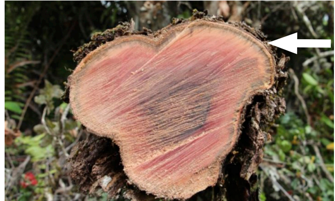
Top: Figure 3. Cross-section of an infected 'ōhi'a showing the characteristic dark staining of sapwood caused by Ceratozystis . Above: Figure 4. Close-up of characteristic dark staining of sapwood from Ceratozystis .

It is not yet known how the disease spreads from tree to tree or from forest stand to forest stand. In other Ceratozystis plant hosts such as sweet potato, cacao, mango, and