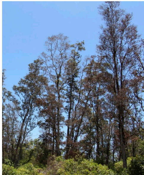
Figure 1. Symptoms of Ceratoctystis wilt of 'ōhi'a include rapid browning of affected tree crowns.

A newly identified disease has killed large numbers of mature 'ōhi'a trees ( Metrosideros polymorpha ) in forests and residential areas of the Puna and Hilo Districts of Hawai'i Island. Landowners have observed that when previously healthy-looking trees begin to exhibit symptoms they typically die within a matter of weeks. Pathogenicity tests conducted by the USDA Agriculture Research Service have determined that the causal agent of the disease is the vascular wilt fungus Ceratoctystis fimbriata (Keith et al. 2015). Although Ceratoctystis fimbriata has been present in Hawai'i as a pathogen of sweet potato for decades (Brown and Matsuura 1941), this is the first record of any Ceratoctystis species affecting 'ōhi'a. It is not yet known whether this widespread occurrence of 'ōhi'a mortality results from an introduction of an exotic strain of the fungus or whether this constitutes a new host of an existing strain. This disease has the potential to kill 'ōhi'a trees statewide.