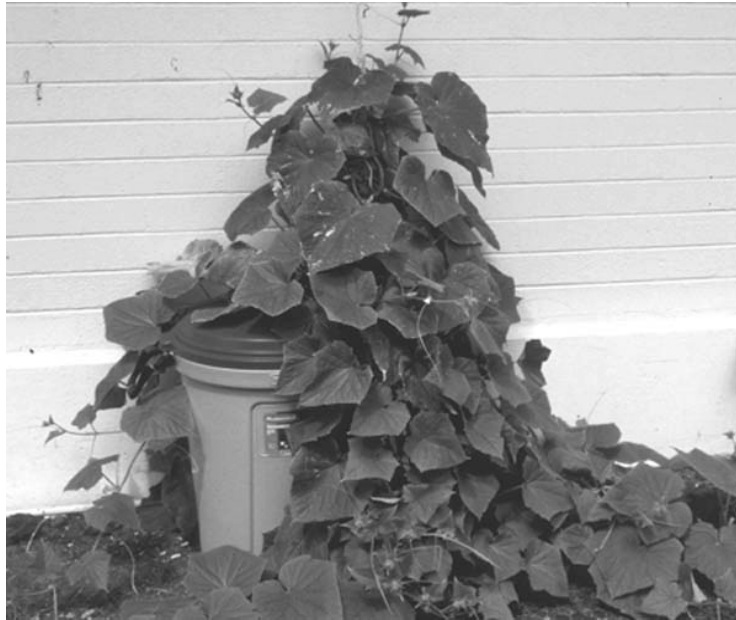
A vigorous cucumber plant growing in a plastic trash container. Pumps and electricity are not required. No additional water or fertilizer is needed beyond the initial set-up.

Then, fill the container with water to about 1 inch from the top. Stir the nutrient solution (water plus fertilizer) again.