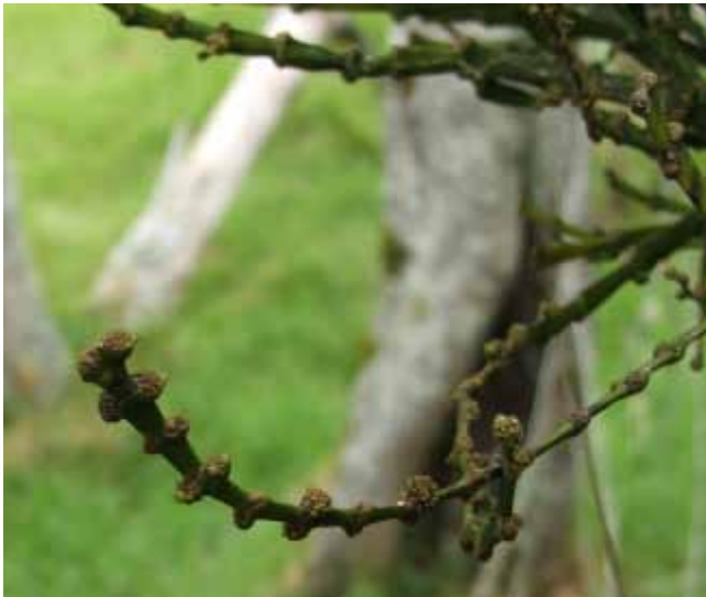
Close-up of a branch of Korthalsella complanata