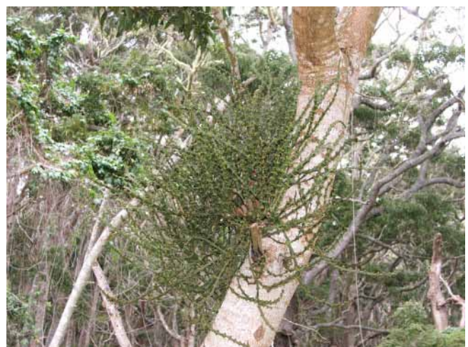
A large Korthalsella complanata plant infecting a young Acacia koa tree near Keanakolu on the island of Hawai'i