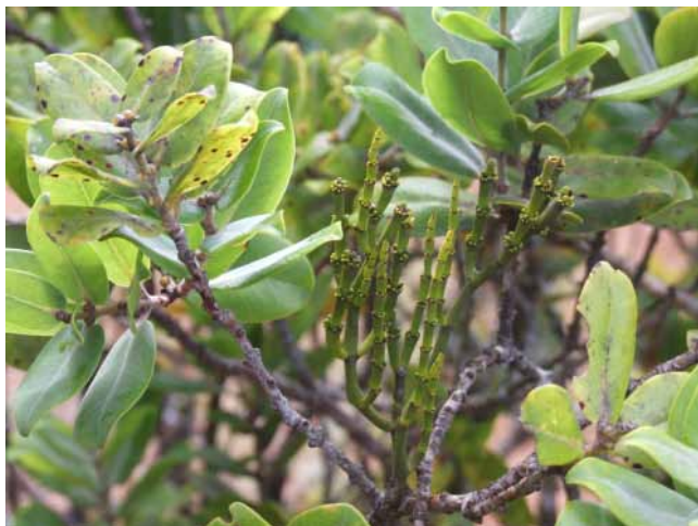
Korthalsella remyana infecting a branch of Metrosideros polymorpha at Alakai Swamp, Kōke'e, Kaua'i