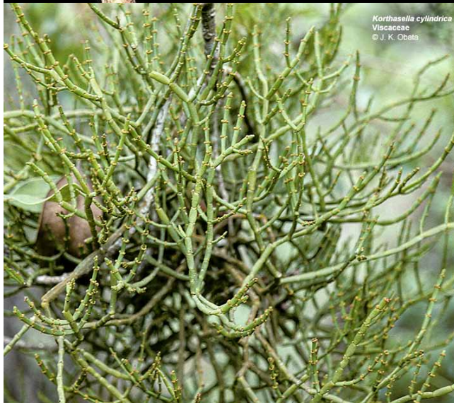
Typical specimens of K. cylindrica on Hawaiian hardwoods. This species is characterized by distichous branching, with branches in same plane.