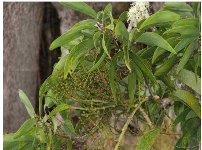
A Korthalsella complanata plant infecting Acacia koa near Keanakolu on the island of Hawai'i