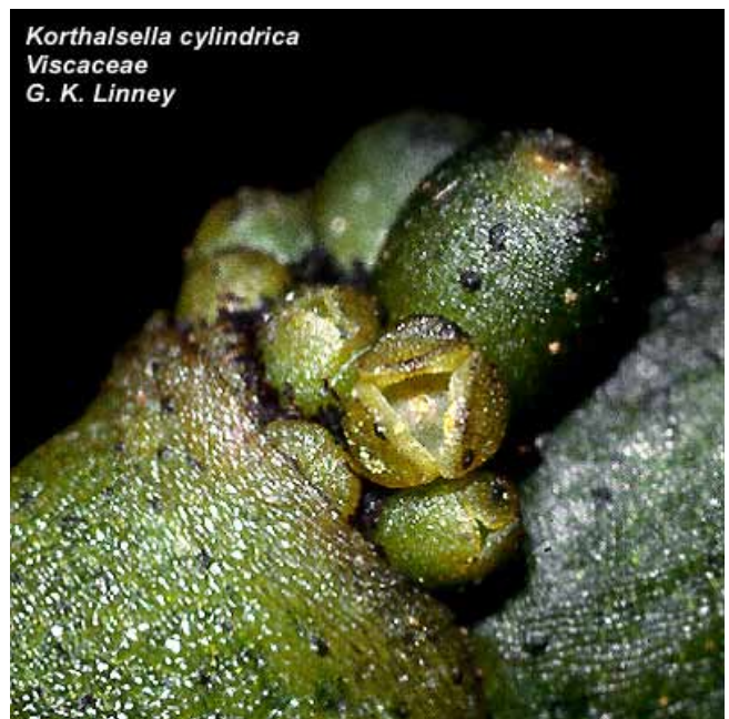
Seeds of Korthal mistletoes are ejected explosively into the environment.