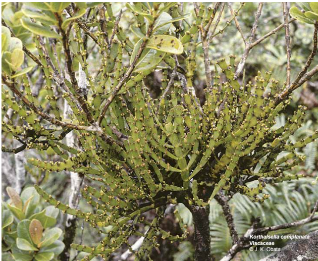
Korthalsella complanata infecting Metrosideros polymorpha