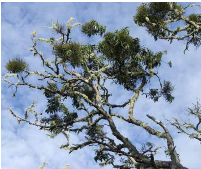
Korthalsella complanata plants dominating the canopy of an old, declining Acacia koa tree near Keanakolu on the island of Hawai'i