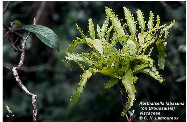
Korthalsella latissima , as the name implies, has wider internodes than the other species, and the stem does not narrow as appreciably at the internodes as stems of K. complanata .