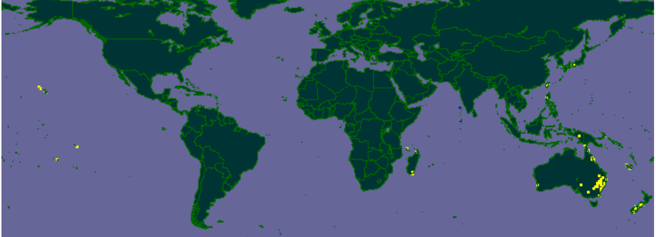
Worldwide distribution of Korthalsella (Global Biodiversity Information Facility Network)

globose in mature bud; perianth lobes 3. Anthers sessile, circular, 2-loculed, introrse, connate into a synandrium, dehiscence longitudinal. Pollen grains prolate, semicircular in polar view. Female flower ovoid in mature bud; perianth lobes 3, minute. Placentation free, central. Style absent; stigma nipple shaped. Berry ellipsoid or pyriform, mostly less than 4 mm, crowned by persistent perianth, exocarp smooth, weakly explosive at maturity.” There are about 25 species in tropical and subtropical temperate regions of the Old World (except Europe), and one species in China (Hua-Shing 1988).