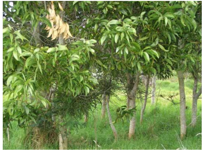
A population of Korthalsella complanata infecting a young stand of Acacia koa near Umikoa, on the island of Hawai'i