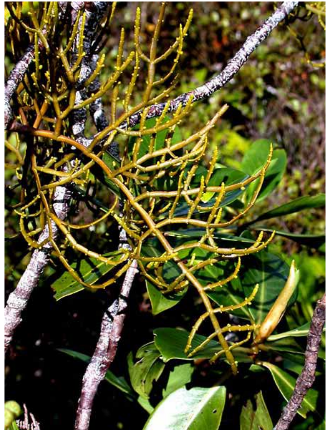
Korthalsella platycaula, French Polynesia, Marquesas islands.