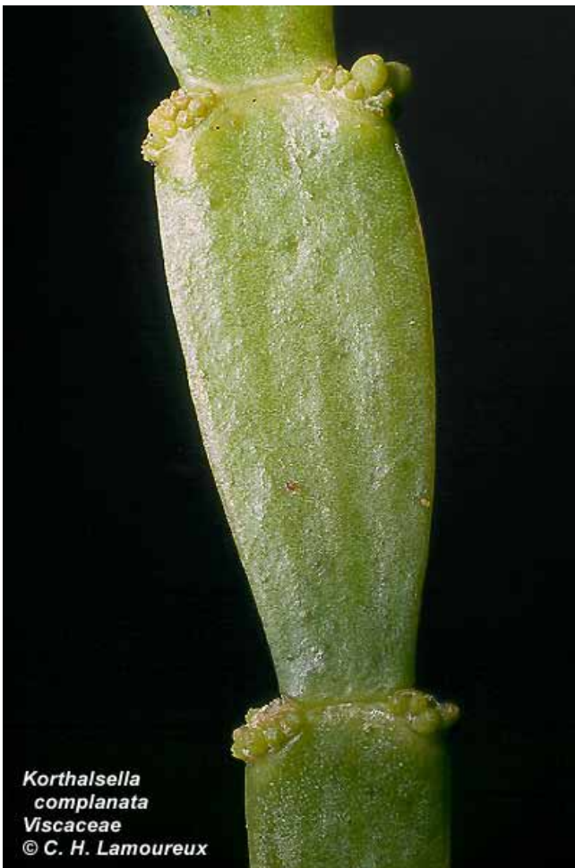
Korthalsella complanata Viscaceae A stem of K. complanata ; members of this species are somewhat variable in morphology, in this case the flattened stem tends to narrow appreciably at the nodes.