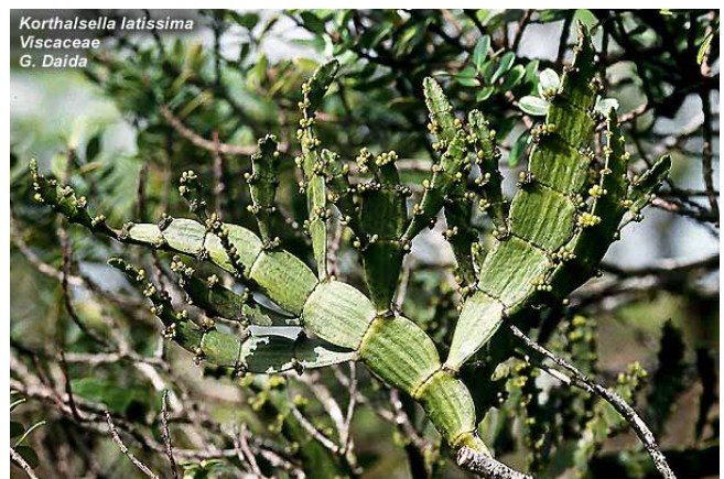
Flattened stems and reduced leaves make K. latissima resemble an aerial cactus.