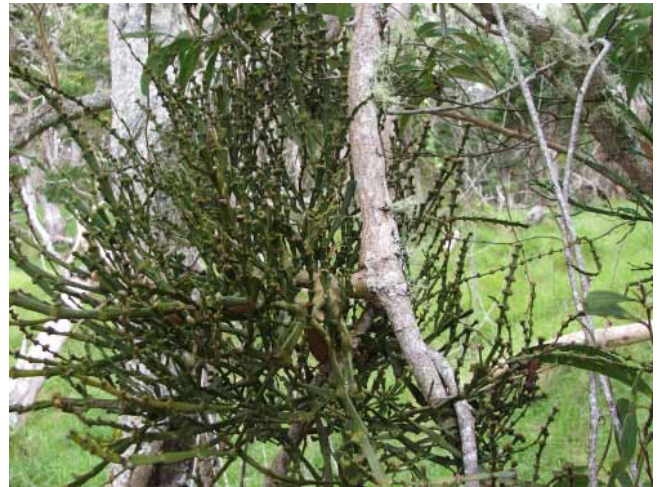
A vigorous Korthalsella complanata plant infecting Acacia koa near Keanakolu on the island of Hawai'i