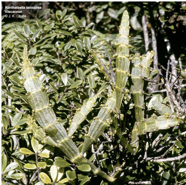
The flattened stems of this specimen of K. latissima are wider than and do not narrow as appreciably at the nodes as the stems of K. complanata above.