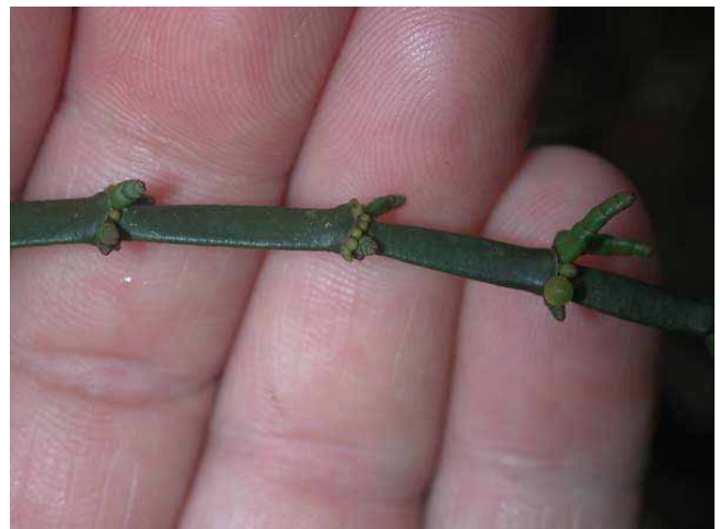
Close-up of flowering stem of Korthalsella platycaula from O'ahu.