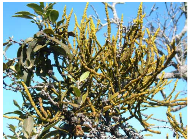
Korthalsella remyana infecting a branch of lama ( Diospyros sandwicensis) at Kaupulehu on Hawai'i