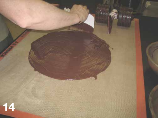
Day 11. When the chocolate is done, a sample tasted should be smooth, not gritty. To "temper" it (make it shiny and crisp) pour the chocolate into a dry metal bowl, remove about one-third of the amount to a second bowl, stir it with a spoon until it becomes chunky, then add it back to the rest and stir until smooth. Immediately pour it our onto a flat silicon sheet, a marble slab, or into molds.