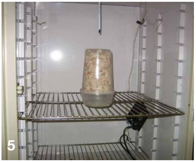
Turn the cup upside down over a dish to catch drainage. Keep at 95°F for 3 days, then pour seeds into a dish and mix by hand, then return them to the cup.