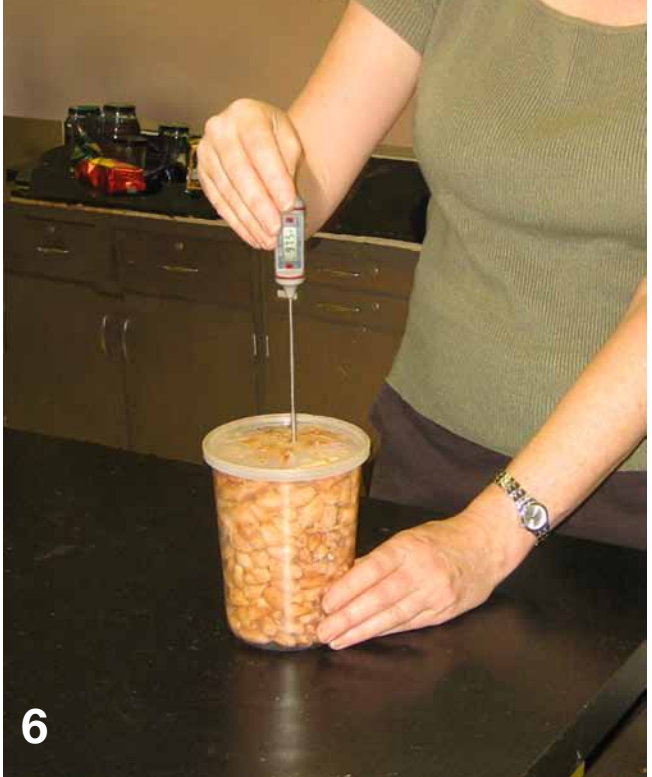
Check the temperature daily. Increase temperature to 113°F for days 4–6. We use an incubator, but a heating pad, heating cable, or even a light bulb with a thermostat control works. If mold—gray, blue, or black fuzzy growth appears on the seeds—the fermentation has failed and the seeds should be discarded.