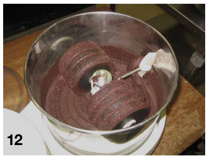
Basic recipe: 55% cocoa liquor, 10% melted cocoa butter, 35% table sugar (all by weight), and a pinch of lecithin. For example, if you have 500 g of cocoa liquor, then the total weight of your chocolate batch will be 500 \text{ g} \div 0.55 = 909 \text{ g} . So you need 909 \times 0.10 , or 91 g, of cocoa butter, and 909 \times 0.35 , or 318 g, of sugar. Cocoa butter and lecithin can be purchased from health food or restaurant supply stores. Pour the ingredients into the bowl of a Santha wet grinder. It is best to melt the cocoa butter first (use a hair dryer, or melt it on a stove). Let the grinder run for at least 16-24 hours, or longer.