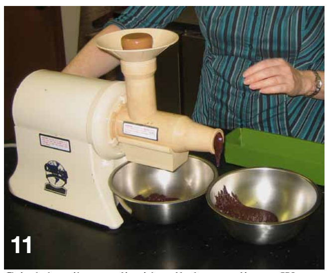
Grind the nibs to a liquid, called cocoa liquor. We use a Champion Juicer (or similar), gently pushing them through with the pestle. Un-ground nibs exit the juicer on the right and are poured into the funnel again until all is liquid. From this point, prevent water or watery liquid from getting into the mixture.