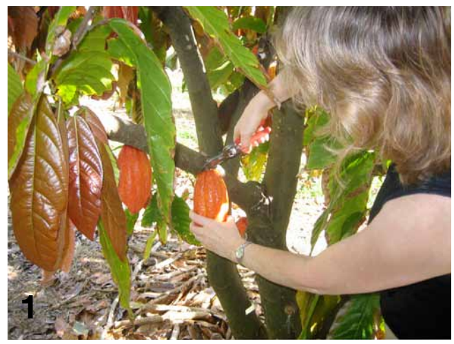
Day 1. Harvest ripe pods, green turning yellow or red turning orange. Seeds are loose in ripe pods but not in unripe pods. If seeds have sprouted, the pod is overripe—don't use it, or remove sprouted seeds.

This publication provides the small-scale cacao grower or hobbyist with a method to transform raw cacao seeds into chocolate using as few as half a dozen pods. The procedure can be used to produce nibs or to make chocolate from dried seeds.