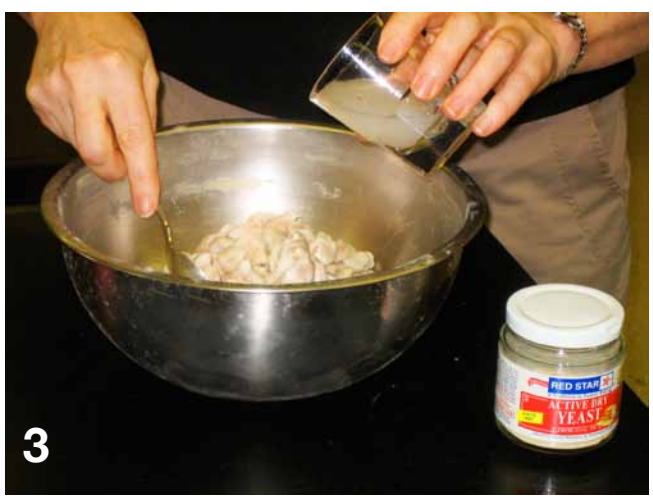
Mix ½ teaspoon of yeast in ½ cup warm water, pour it onto 2–3 lb fresh seeds, and stir. This is to start fermentation, which is essential for developing the chocolate flavor.