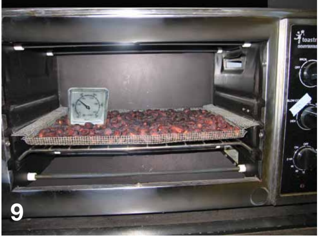
Day 9 or 10. Roast a single layer of seeds at 275°F for 1 hour, or 30–40 minutes at 300°F. The oven will smell like brownies baking. Roasting creates the flavor and aroma if the fermentation was good. Best results are with a convection oven.