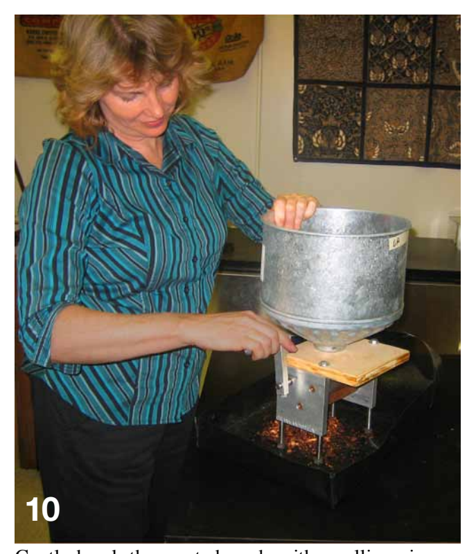
Gently break the roasted seeds with a rolling pin; we use a hop crusher, shown here. Separate the shell pieces from the seed pieces (called nibs). We use an air separator, but a hair dryer set on cold, a small vacuum cleaner, or a fan, will work as well. Shell pieces can make the chocolate bitter.