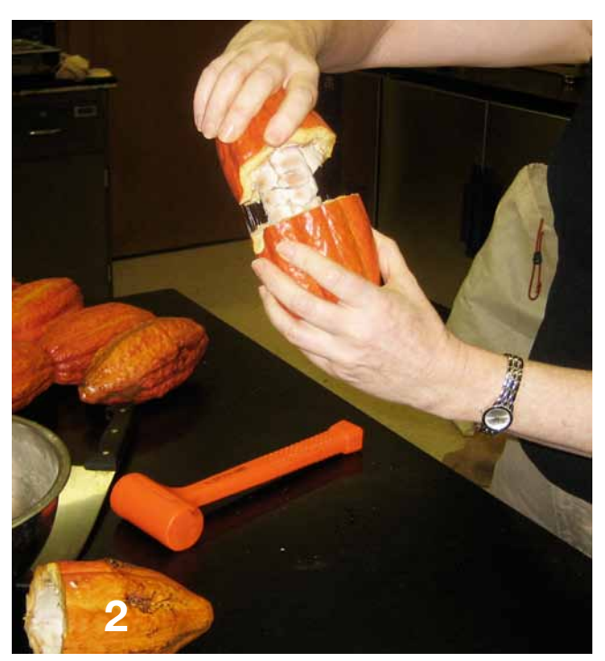
Use a mallet or cleaver to crack the pod between the middle and the stem end. Pull seeds off the core.