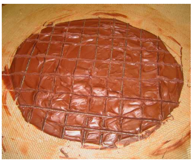
If you score lines in the cooling chocolate, it will easily break apart when cooled.