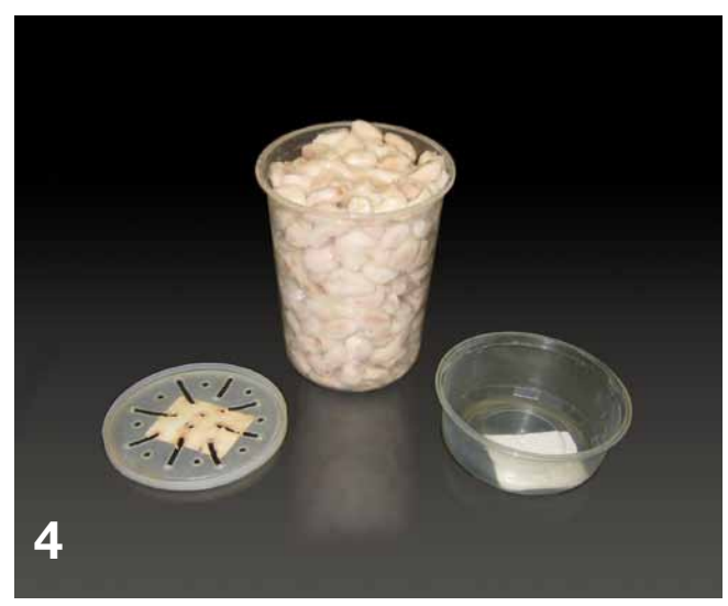
Pour seeds into a 1-qt plastic cup. (Note the drainage holes in the lid.)