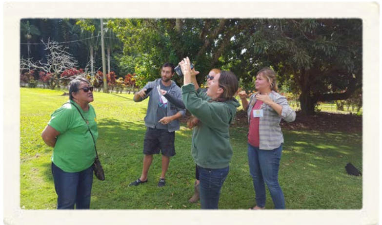
New Master Gardener trainees act out "Garden Charades" for a certified Master Gardener to guess. The word: Mountain Apple.