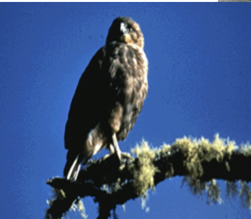
‘lo ( Buteo solitarius )