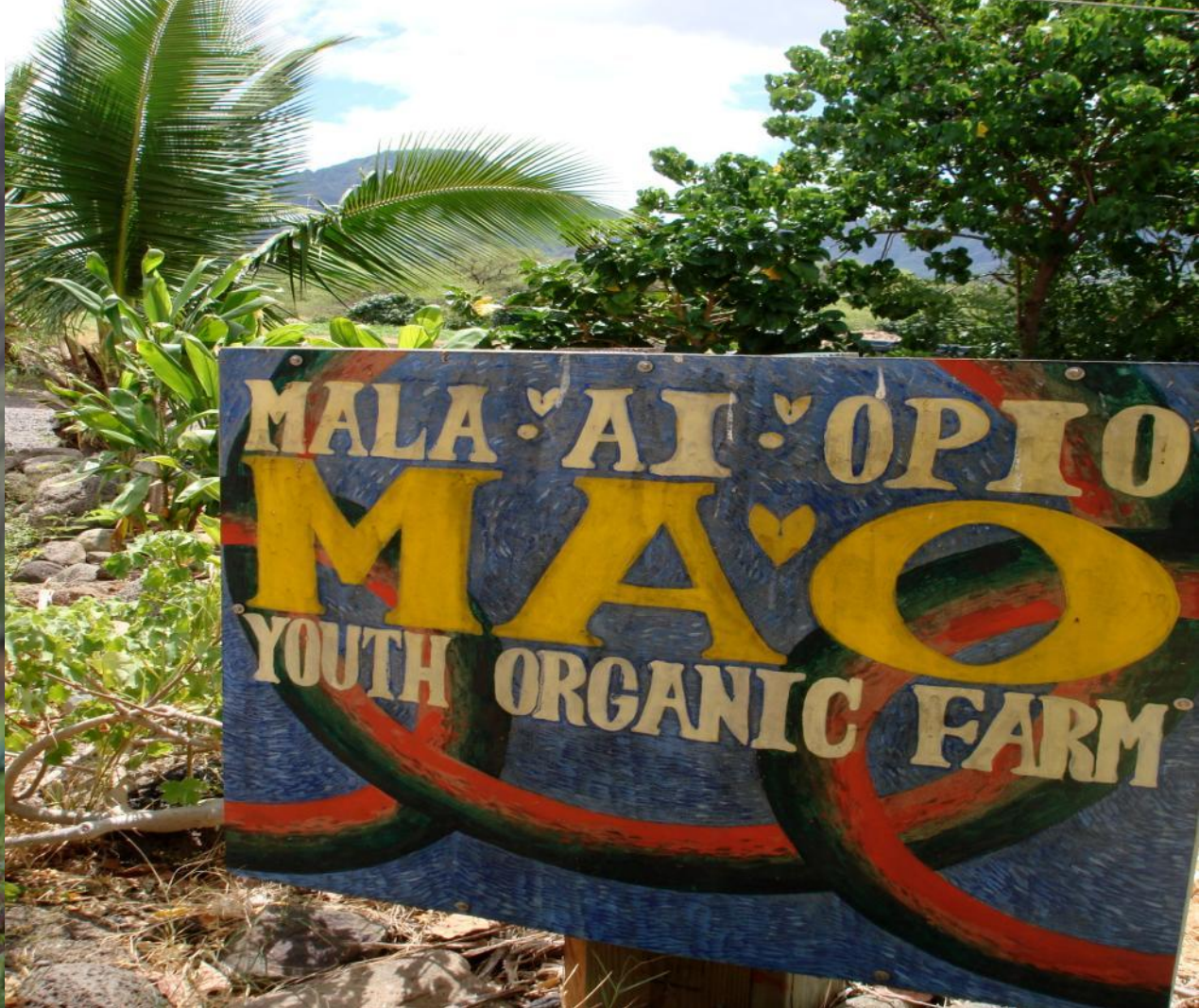
MA'O Farm, O'ahu 2009