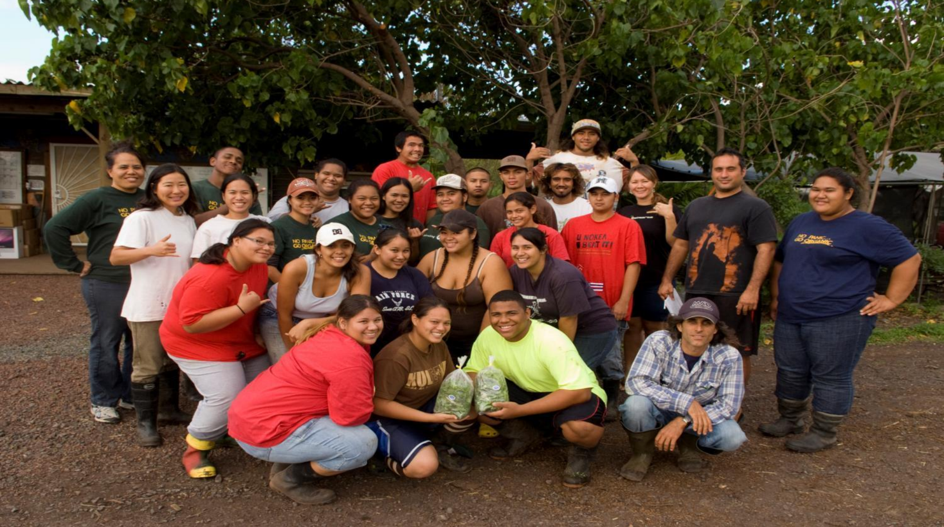
MA'O Farm, O'ahu 2009