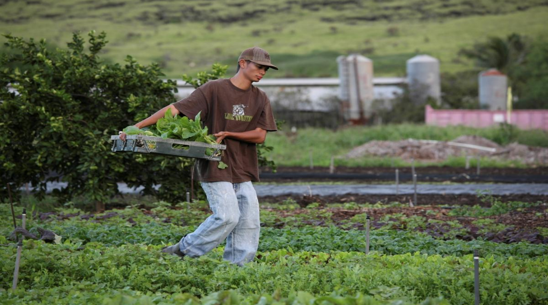
MA'O Farm, O'ahu 2009