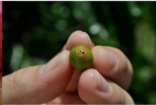
CBB hole in green cherry