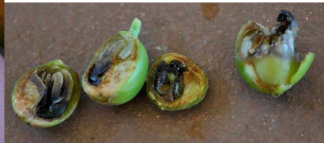
CBB already destroyed beans in green cherry