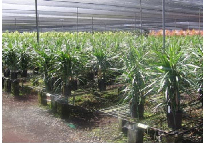
Foliage plants at California Hawaii Foliage Growers in Kee’au, HI.