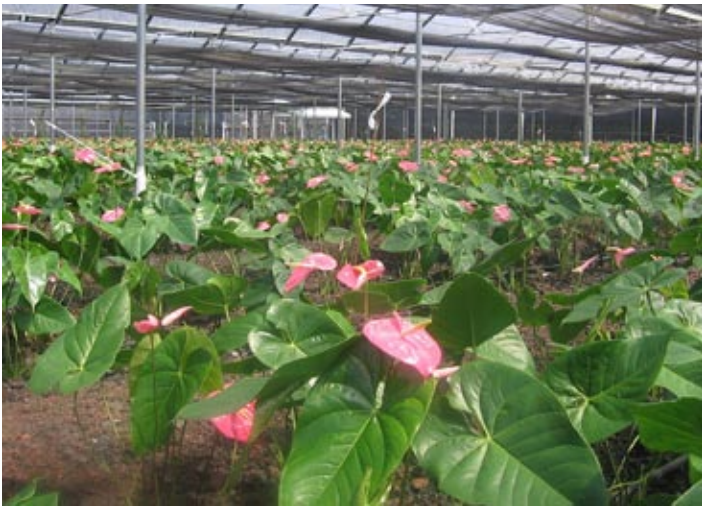
Large anthurium flowers grown for cut flowers at Greenpoint Nurseries.

We retraced our tracks, returning to the Mealani Station, where our visitors learned about the grass-fed beef, protea, blueberry and tea projects.