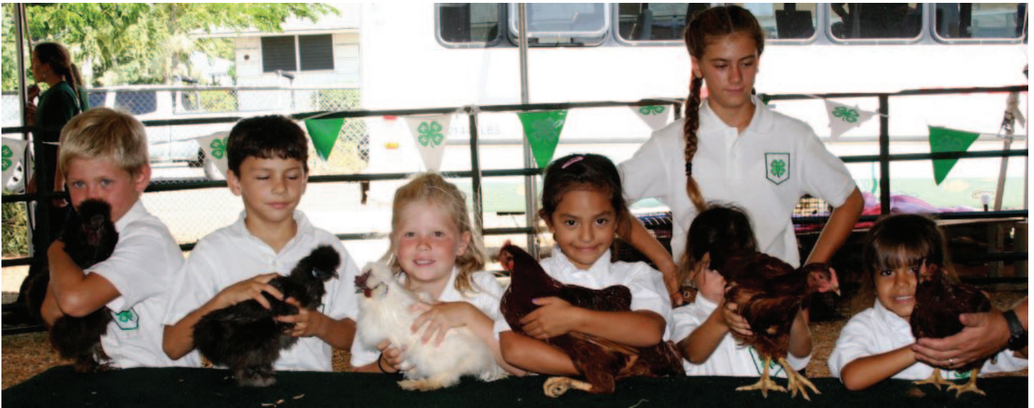
Poultry exhibitors at the 2009 Farm Fair at the Bishop Museum.

a county fair, is an opportunity for family members to work together and to work with other families in their community.