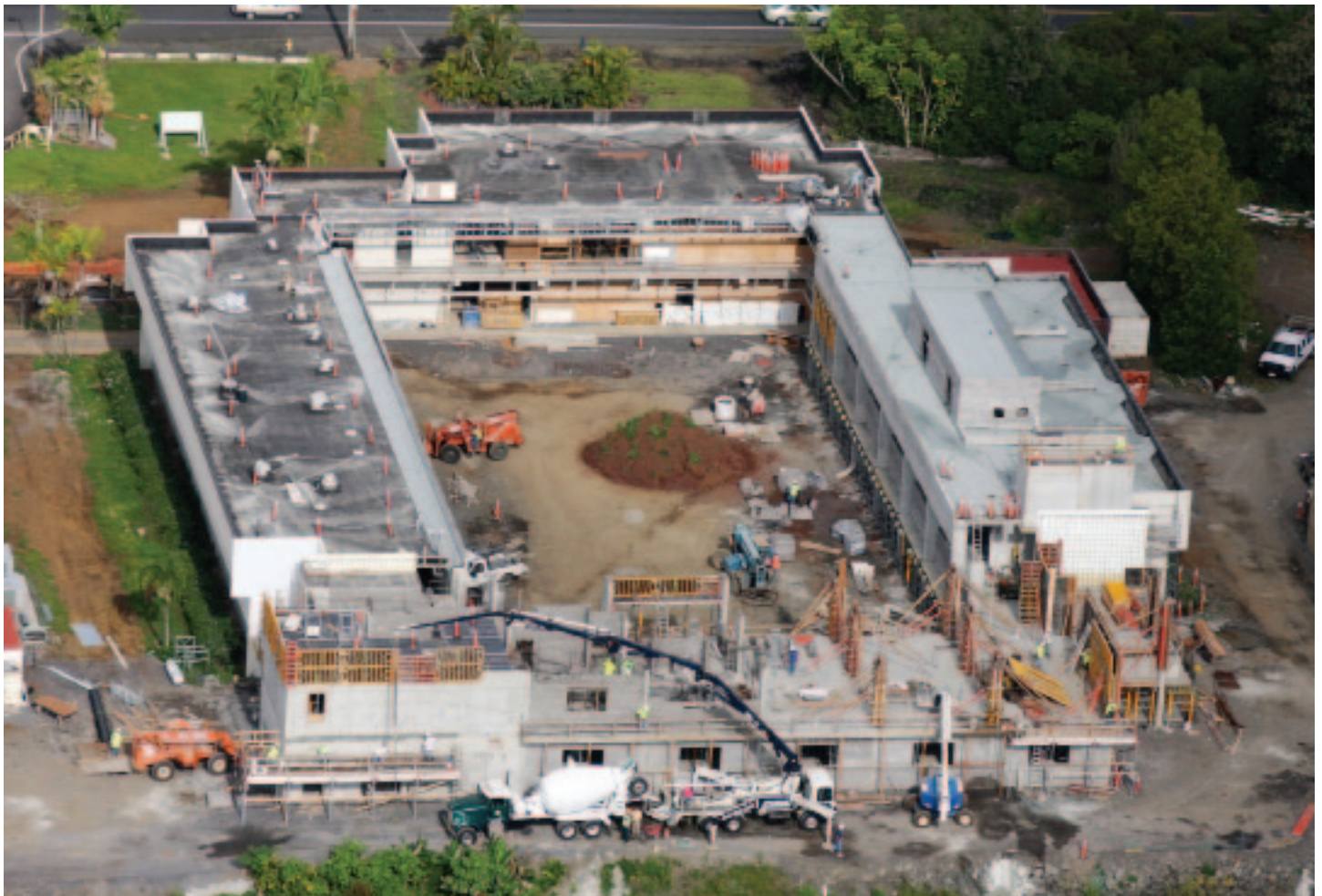
What Komohana looked like when work was in progress.