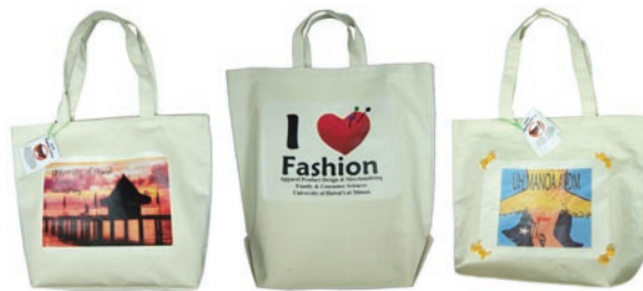
Designer totes are just one project in Shu Hwa's lab.

At UH-Manoa, more than 100 undergraduate students majoring in Apparel Product Design & Merchandising have been trained to be aware of eco-product market trends. As part of the APDM 411 Production Data Management course over the summer, I assigned an eco-friendly organic cotton tote bag APDM fundraising project, which led to many lovely student designs. I have also guided several students through the APDM 499 independent study course to design and create eco-fashion projects, using natural dyes such as coffee stains. Following are five examples of coffee stain, green, and flower motifs, comprising three student projects and two personal projects.