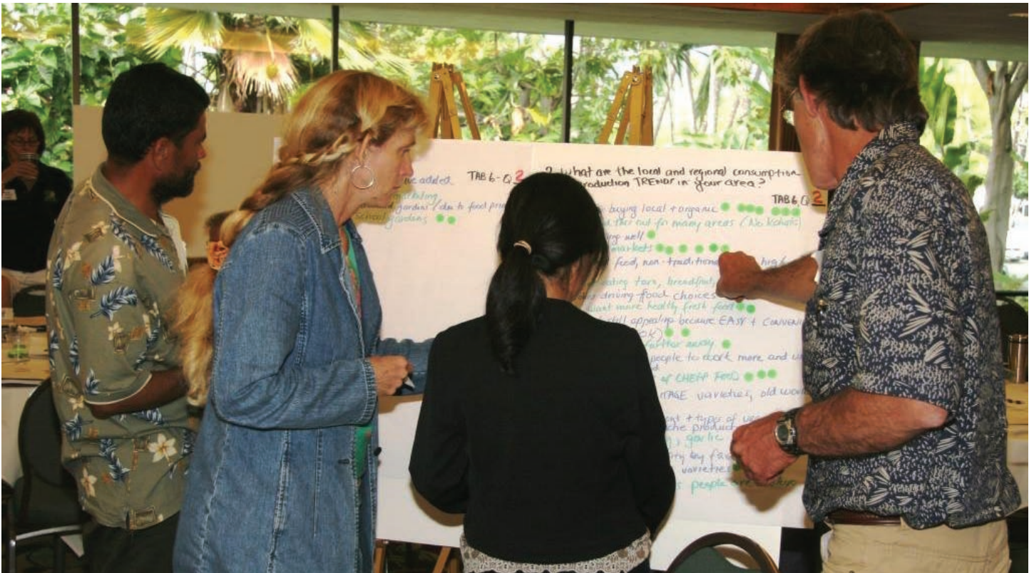
Meeting participants vote on top priorities.