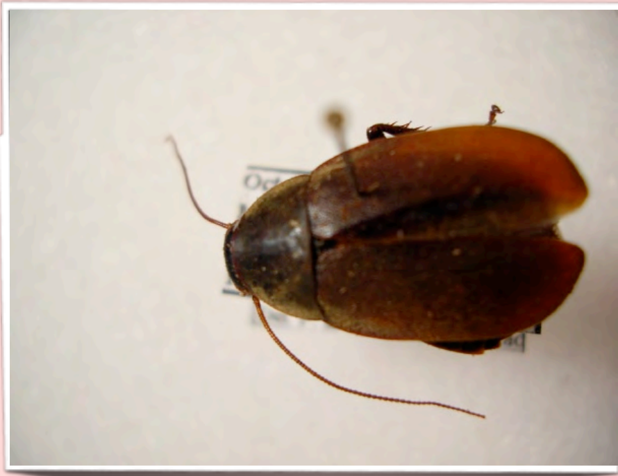
Pacific Beetle Cockroach – Photo Credit Forest & Kim Starr