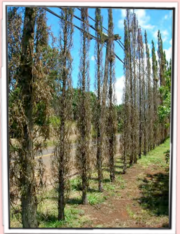
Pacific Beetle Cockroach Cypress Tree Damage

Sanitation is essential in controlling these prolific pests. Once roaches are observed on the trees, trees should be thoroughly washed and any pests found should be exterminated. The Pacific Beetle Cockroach is the only cockroach capable of mammal-like live birth. This unique capability accounts for their rapid numbers and makes them highly desirable for use in scientific research projects. The only chemical product currently in the Hawai'i Pesticide Information Retrieval System approved for outdoor control of cockroaches on cypress is the OMRI product listed Evergreen Pyrethrum Concentrate. When using any pesticide, thoroughly follow the directions on the label.