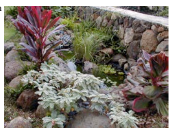
Red Ti, native Ohai and water plants At Waimanalo Health Center gardens