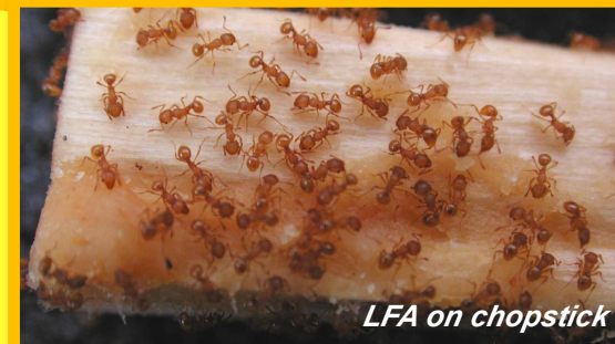
LFA on chopstick