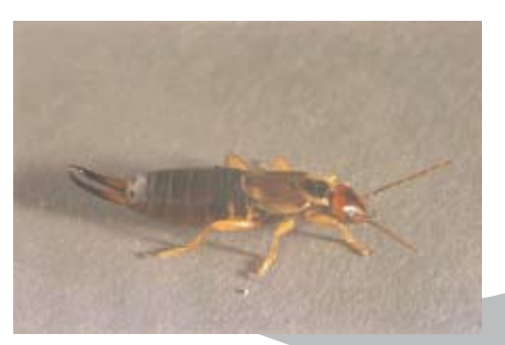
Figure 7. Earwig.

Earwigs can be recognized by the forceps-like pincers on the end of the abdomen (Figure 7). They have chewing mouthparts and feed primarily on decaying organic matter and other insect species, but they also chew holes in many flowers