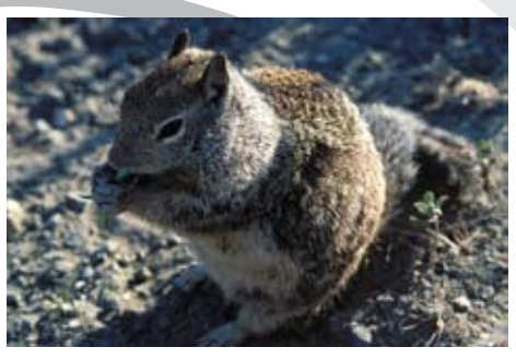
Figure 9. Ground squirrel.

You can repel moles, gophers, ground squirrels (Figure 9), and marmots by placing jalapeño peppers within 4 inches of where they are invading. For marmots and deer, you can use castor oil; electric fences also will repel deer. To control ants, saturate cotton balls with peppermint oil or mix the oil in a spray bottle with water (1 part peppermint oil to 10 parts water) and apply where needed. Hot water also works.