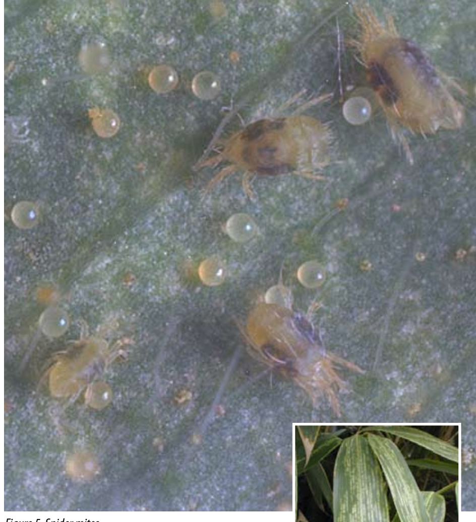
Figure 5. Spider mites.

Damage. Plants or leaves damaged by spider mites appear off-color. Close inspection reveals