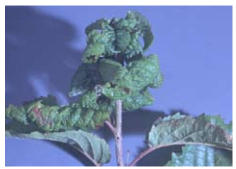
Figure 2. Aphid damage.

Control. Aphids breathe through spiracles or small breathing holes. Insecticidal soap, available at most garden centers, controls aphids by clogging their breathing holes. An alternative is to mix 1 teaspoon of vegetable oil, 1 teaspoon of dishwashing liquid, and 1 cup of water. Another option is a mix of 3 tablespoons of liquid soap and 1 gallon of water. This makes a 1 percent soap solution.