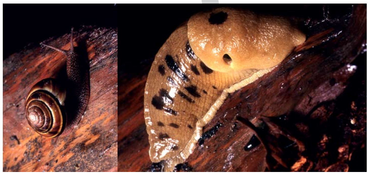
Figure 3. Snail.

Caution: When using these remedies, test your mixture on a small number of plants or a small part of a plant to evaluate possible toxic effects. Plants with hairy leaves tend to hold soap solution on their leaf surfaces, where it may burn. The greater the strength of the solution, the hotter the day, and/or the more a plant is water stressed, the greater the likelihood of burning.