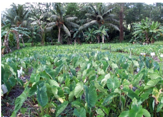
Fig. 1. Dry land cultivation of blight resistant taro from Palau.