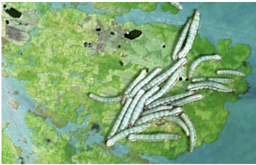
Fig. 3. Armyworm larvae feeding on surface of a taro leaf.

Armyworm. Many American Samoan farmers list armyworm ( Spodoptera litura ) as the main taro insect pest. Outbreaks are sporadic and vary in location and intensity. A female moth lays 200-300 eggs in a cluster on a leaf; eggs hatch in 4-8 days. Larvae feed side-by-side on the leaf (Fig. 3) and within a few days, only the skeleton-like leaf veins may remain.