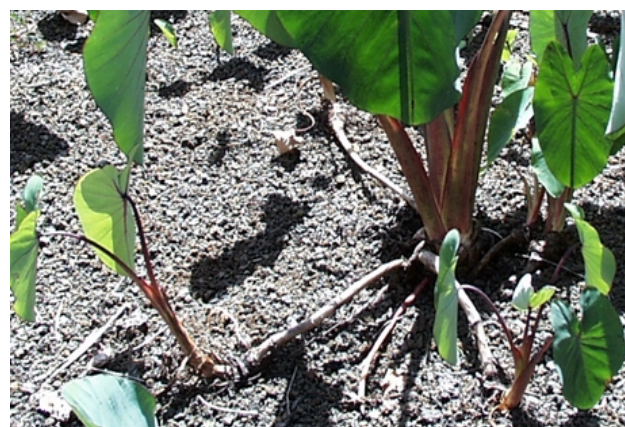
Fig. 2. Lauvai (runners) growing from resistant taro cultivar.

Taro is often interplanted among banana, giant taro, coconut or forest trees and on level ground or steep slopes. Land is usually cleared with a bush knife. New plants are generally obtained from family or neighbors. Planting areas expand rapidly as most taro varieties form lauvai , which are replanted along with the tops from harvested corms ( tiapula ). A pointed wooden pole or metal bar ( oso ) is used to make a hole 6-8 inches deep, a tiapula is inserted and a small amount of soil tamped around its base. Some farmers apply coconut or banana leaves as mulch but most weed control is done by hand. Fertilizer and pesticides are not usually used. When plants mature in 6-9 months, corms and outer leaves are removed. The remaining leaf stems are cut approximately 12-16 inches above the removed corms and these tiapula are either allowed to dry for a few days or replanted immediately.