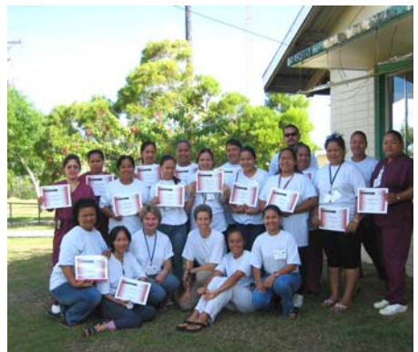
The survey team with training completion certificates