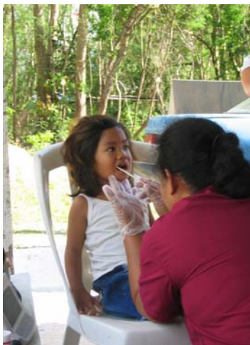
Child receiving dental screening during survey