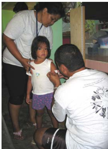
Measurement of arm circumference during survey