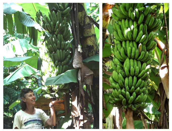
Figure 4. The BLS-resistant FHIA-25, needs no fungicide application to produce these large bunches.

Several FHIA cultivars are being multiplied in the Land Grant tissue culture laboratory for distribution to growers. The goal is to decrease fungicide use in American Samoa through introduction of BLS-resistant banana cultivars.