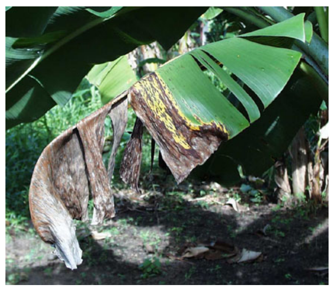
Figure 1. Severe damage to the 'Williams' cultivar decreases photosynthesis.

Most fungicide use in American Samoa is for control of BLS. The Cavendish-type 'Williams' banana, grown by all commercial growers in American Samoa, is very susceptible to the fungus that causes this disease. Infected plants have fewer leaves, which leads to fewer and smaller fruits, a delayed harvest, premature ripening, and lower quality fruit (Fig. 1).