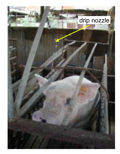
Drip cooling a sow

comfortable. A hose with a drip nozzle is suspended over each farrowing crate in a position that allows water to drip slowly over the sow's neck and shoulder area. Evaporation of the water has a cooling effect, making the sow more comfortable and reducing heat