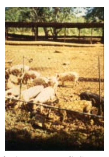
Pigs in the sun are easily heat-stressed

Following are seven economical methods to keep pigs cool and to maintain healthy and happy pigs.