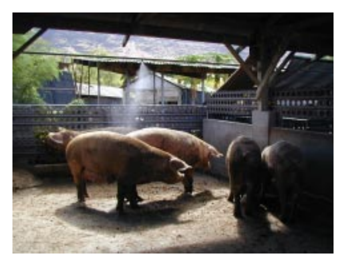
Pigs enjoy the cooling provided by a sprinkler