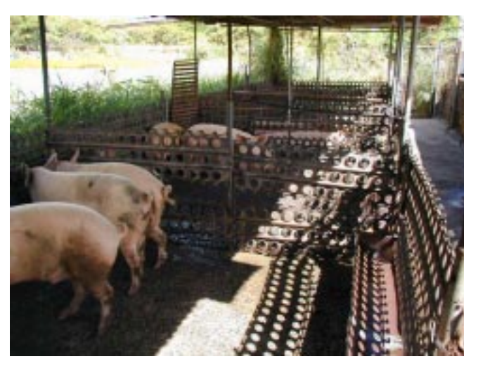
Openings in pens allow air movement to keep pigs cool