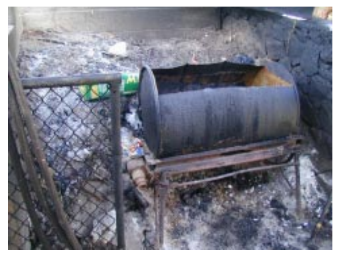
On-farm cooking of food discards