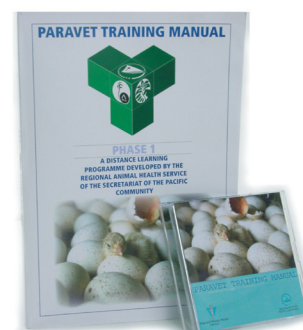
The Paravet manual and CD.

Purpose of the Project: To establish a self-sustaining, Pacific-relevant distance learning program on the basics of veterinary medicine and animal husbandry, and to work with national and international partners to educate a select cadre of paraveterinarians in all 24 Pacific Island nations.