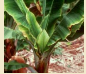
Leaves bunched up