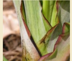
Petiole with mottling