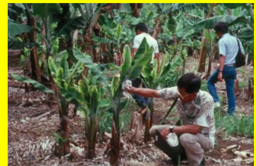
Clockwise from top left: adult female wingless aphid, adult winged aphid, and banana plants with severe bunchy top symptoms