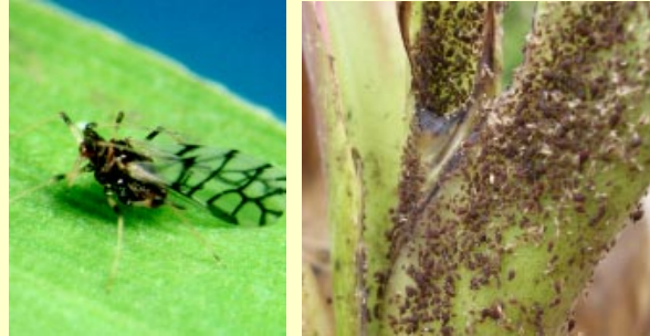
Winged banana aphid Aphid colony on banana petiole