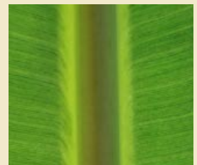
Veins form green hooks