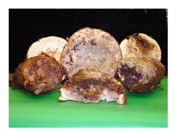
Pythium corm rot

Why utilize genetic engineering (GE) of taro to increase disease resistance?