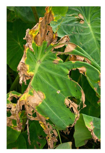
Phytophthora leaf blight