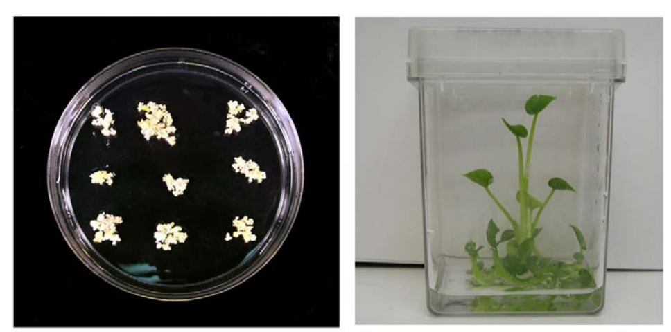
Taro calli (undifferentiated tissue)

Each disease-resistance gene was transferred separately into callus (undifferentiated tissue) of variety Bun long in tissue-culture. Then, we manipulated plant hormones to produce shoots and then whole plants from the callus.