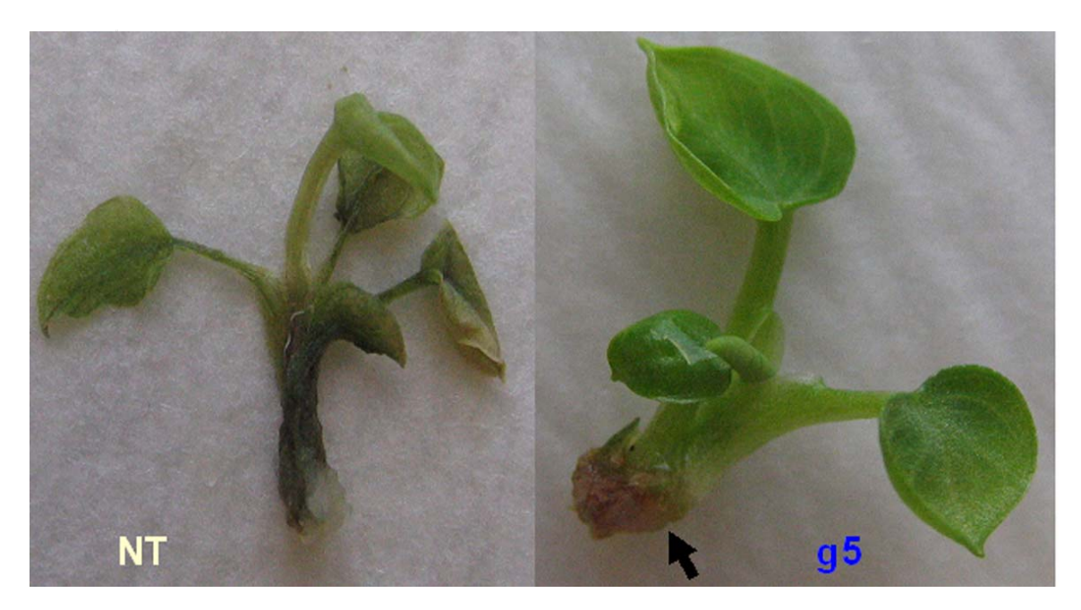
Untransformed Chinese taro (NT) infected with Phytophthora colocasiae at 12 days after inoculation. Note plant is almost dead.

Do these disease resistance genes help Chinese taro resist pathogens? Yes, in preliminary tests using small, tissue-cultured plants.