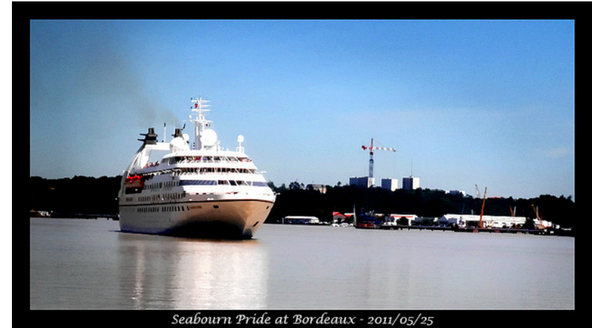
Seabourn Pride at Bordeaux - 2011/05/25