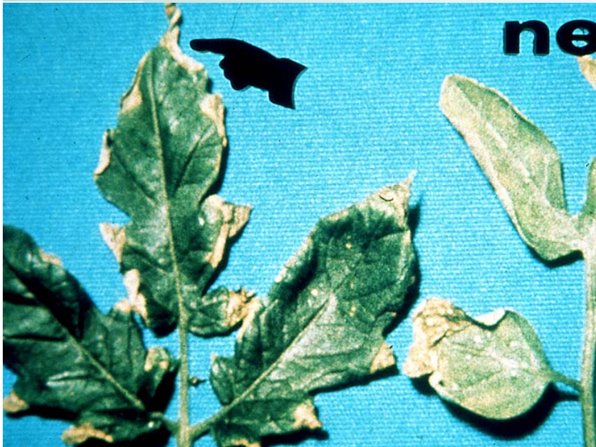
opical A wai'i at Mā