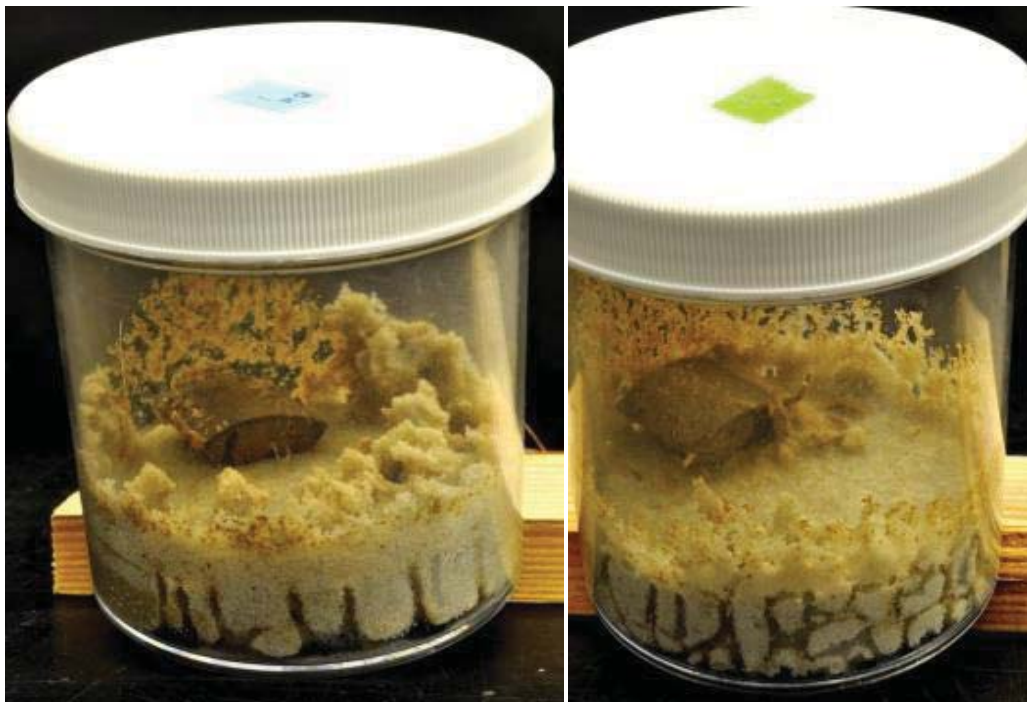
Figure 1. Sample test jars of C. formosanus (left) and C. gestroi (right).