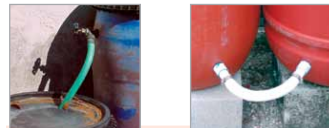
Connecting rain barrels together will allow for more water collection.

To store even more rainwater, multiple rain barrels can be linked together with hard PVC or flexible hose. Although you can use small diameter pipe or even a garden hose, large diameter pipe or tubing (1.5"-2") will be able to carry more rainwater during a heavy thunderstorm and will prevent water from possibly backing up the downspout. Steps to connect an overflow outlet and link barrels together are covered later in this booklet.