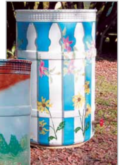
Rain barrels may be painted to increase their aesthetic value.