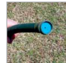
Remove the pressure-reducing washer from the soaker hose.