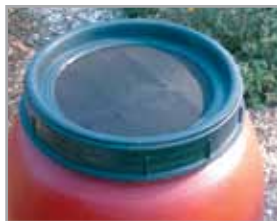
A barrel covered with window screen can be placed under a roof valley to collect rainwater runoff.

Elevating the rain barrel on a platform, such as cinder blocks, will give additional water pressure and will provide clearance for connecting a hose or filling a watering can.