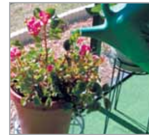
Hand water plants.

soaker hose or a length of PVC pipe or garden hose with holes punched in it may work with these low pressures. If using a soaker hose, take out the pressure-reducing washer to allow more water to flow through the hose ( bottom right ). Filling a watering can to water plants around the yard is always an option. You can also use the water to keep your compost bin moist or to rinse off gardening tools.