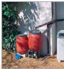
Gutters and downspouts funnel rainwater to the rain barrels.

Most storage tanks are placed above ground to take advantage of the force of gravity. A below-ground tank requires a pump to get the water out. This increases the cost and maintenance of the system.