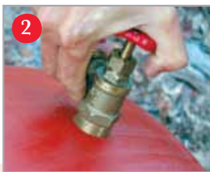
2 Next, screw in the hose spigot about halfway. Make sure the threading is going in straight, as this will help prevent leaking.