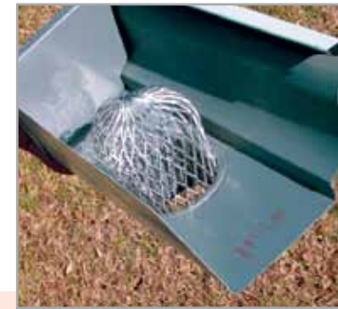
A window screen placed over the barrel opening (left) or a gutter strainer placed in the downspout opening (right) will keep leaves and other debris out of the rain barrel.