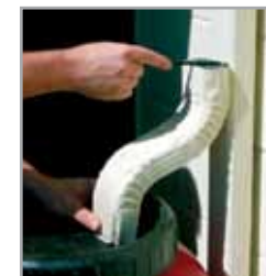
Mark downspout for cutting

To make the transition from the gutter/downspout to your opening in the rain barrel, you can fabricate a crosspiece out of downspout material or purchase a flexible downspout extender. The flexible downspout extender eliminates the need for exact measurement because it bends and stretches to the length you need. Make sure the downspout extender fits the size of your downspout.