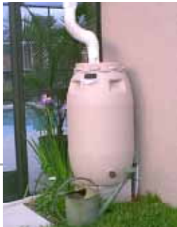
This barrel was painted to match the house color.

Outdoor acrylics and spray paint work well, but the barrel must first be primed so these materials adhere properly to the surface. A product on the market is a spray paint designed specifically for outdoor plastic furniture, but it will work on almost any plastic surface. The benefit to this product is that the barrel does not have to be primed before applying the spray paint. If using spray paint but need to paint small details, spray some paint into a small cup, making a liquid puddle. This paint can be brushed on.