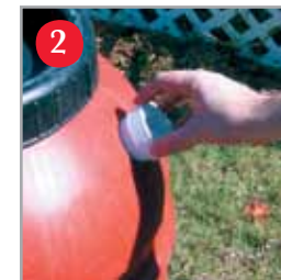
The 2" male adapter is screwed in to make the transition to our overflow pipe.