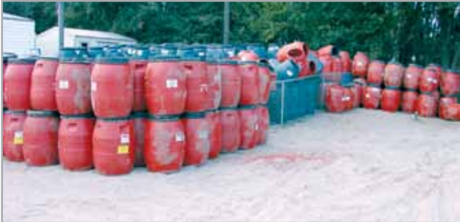
This barrel supplier has hundreds of barrels in varying sizes available to the public.

There are companies that sell pre-constructed rain barrels. These pre-assembled "kits" come with the inlet and outlet already installed. They will also carry the necessary tubing for connecting barrels together. If you cannot find one locally, check the Internet for a supplier. The Internet is also a good resource to find an abundance of information about rainwater harvesting, rain barrels, cisterns and suppliers.