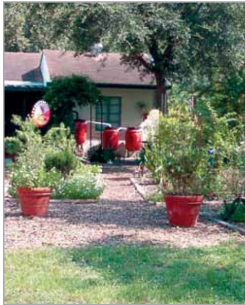
Rain barrels are one component of this water-efficient landscape.

Although a small rain barrel may not provide all the water needed to sustain your plant material, it can certainly supplement your current watering schedule. Planter beds, vegetable or flower gardens and potted plants can easily be irrigated with the water from a rain barrel.