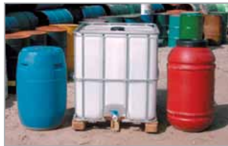
Some common containers used for rain barrels are (left to right): 50-gallon sealed barrel, 275-gallon juice container, 50-gallon open-top barrel.