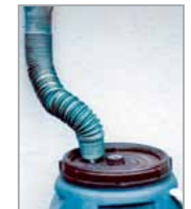
Flexible downspout extender