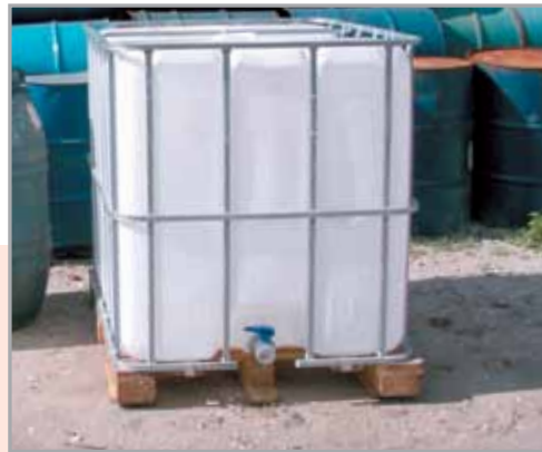
A small submersible pump could be placed inside this 275-gallon juice container. Using a timer on the pump's power cord could allow you to establish an automatic customized watering schedule.

Note: It is important to keep any plumbing attachments to your rain barrel or cistern independent from your existing house piping or sprinkler system piping. This will prevent a cross-connection to your potable water.