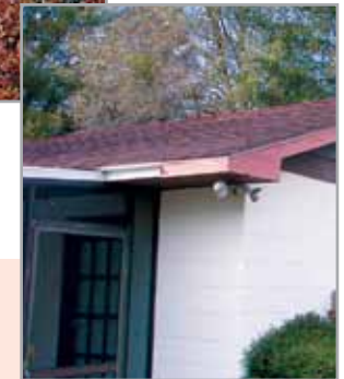
A roof makes a perfect catchment area.

Other forms of catchment areas may include sidewalks, driveways and natural or man-made swales or berms in the landscape that can direct the flow of rainwater to a storage tank.