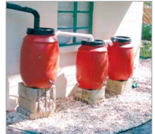
Multiple barrels provide for greater water storage.

Cisterns and rain barrels have been around for thousands of years and the time has come for more homeowners to enjoy their benefits.