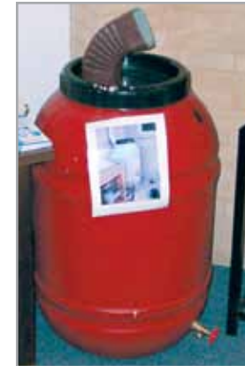
Hillsborough County Extension Service has a demonstration rain barrel.

Many county Extension offices have rain barrel demonstration exhibits where you can see examples of rain barrels that any homeowner can install. The Extension offices also provide an abundance of information on plants, gardening, composting and water conservation. Most county Extension offices offer workshops on all of these subjects.