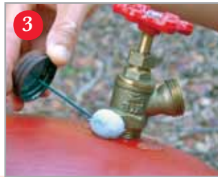
3 When the spigot is in about halfway, apply a liberal amount of PVC cement to the exposed threads. Continue to screw in the spigot until it is snug and pointing toward the bottom of the barrel.