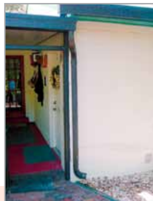
A good spot for a rain barrel.