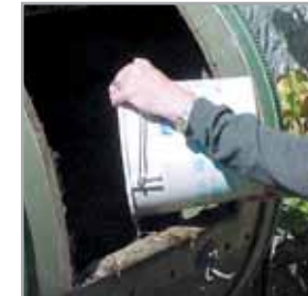
Use to keep compost bin moist.