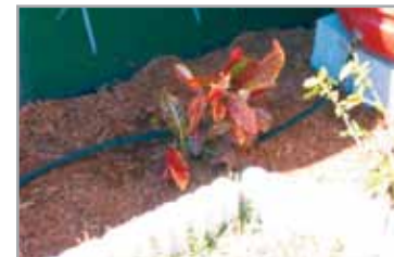
Attach a soaker hose to water nearby plants.