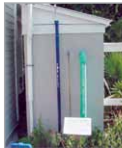
These cisterns at the Florida House Learning Center each hold 2,500 gallons of rainwater.