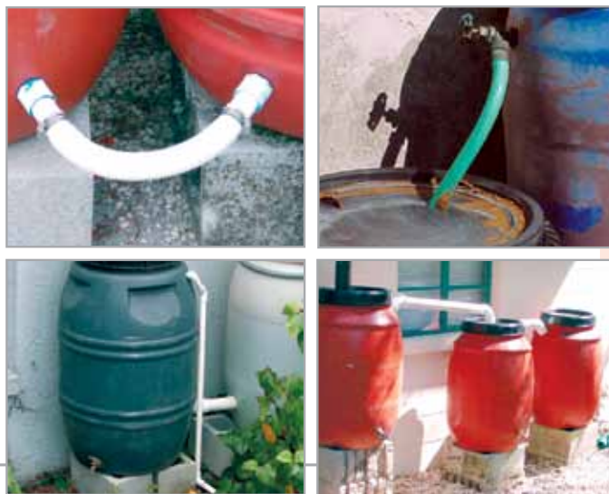
Types of connections: flexible hose clamped on PVC fittings (top left), garden hose (top right), 2" PVC pipe connected at bottom of barrels (bottom left), 2" PVC pipe connected at top of barrels (bottom right).

If you make the connections at the top, you will need to have an outlet on each barrel. Once the water level drops below the connection pipe, there will be no other way for the water to drain out of the barrel without an additional outlet. If the connection is made at the bottom, only one barrel will need an outlet because the water level in the connected barrels will drop equally as water is let out. For bottom connections, an outlet can also be placed in the pipe or tubing connecting the barrels, instead of the barrels themselves.