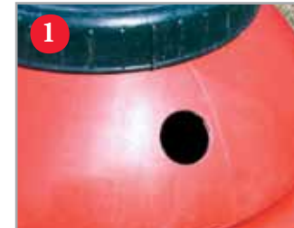
We first start by drilling a 2 1/4" hole for the 2" male adapter. Since this is an overflow, it will have to be near the top of the barrel.

You can use PVC pipe, rubber tubing or even a garden hose as an overflow. In this example, we will use 2" PVC pipe as our overflow. Although smaller piping or hose will work, large diameter piping will handle even the biggest thunderstorms.