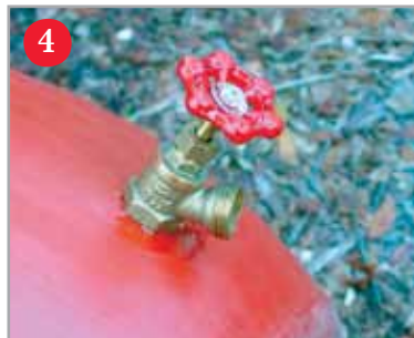
4 The rain barrel outlet is now complete.