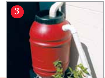
A 90-degree elbow and a length of 2" PVC pipe are added to carry the water away from the house to a nearby planter bed.

PVC cement is generally not needed because the pieces should fit tightly together and a little leakage is okay. It also makes it easier to disassemble the pieces for cleaning or maintenance, if necessary.