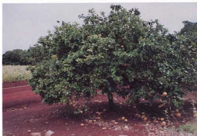
Fig. 1. 'Puma' tree.