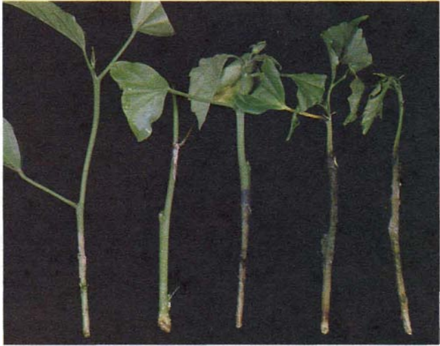
Figure 2. Stem rot with wilting leaves.

The disease was characterized by extensive and prominent development of white fungal