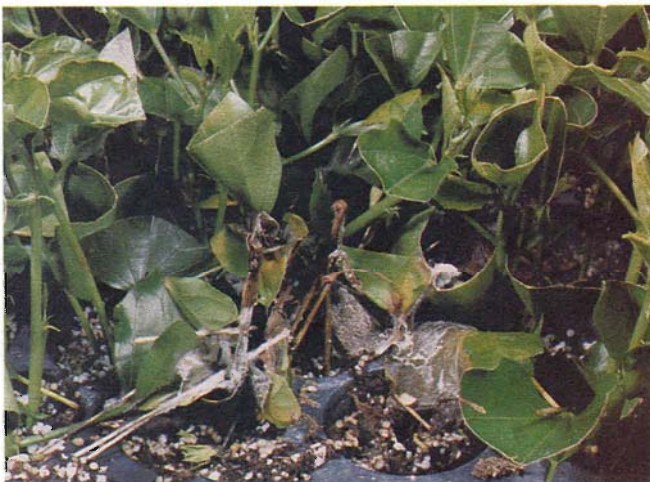
Figure 1. Hibiscus blight on cuttings.