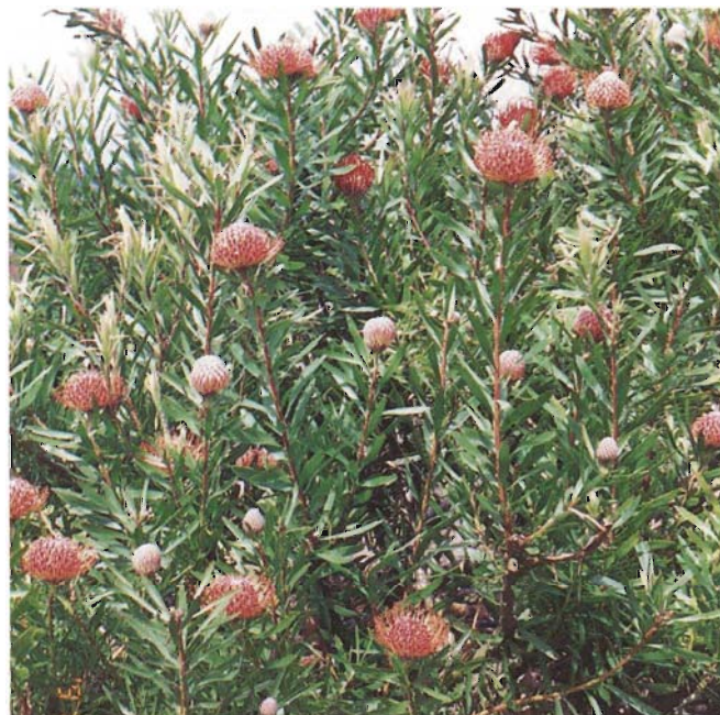
Fig. 2. 'Pohaka La Hawaii' plant in bloom.

'Pohaka La Hawaii', or Hawaiian sunbeam, is a hybrid sunburst protea with bright red flowers resembling the sunrise.