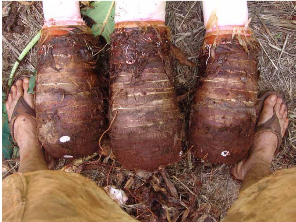
Corms of CTAHR's Pa'akala taro, resistant to taro leaf blight, each weighing about 20 pounds, grown on Moloka'i