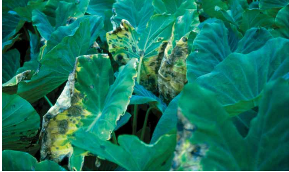
Taro leaves infected with taro leaf blight. Taros brought by Polynesian voyagers to the Hawaiian archipelago lack resistance to the leaf blight pathogen, Phytophthora colocaseae . The infection is systemic in these taro varieties: the lesions will spread over the leaf, and it will die.