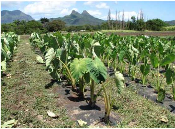
Field trials of organically grown taro at CTAHR's Waimānalo Research Station.

Ancient (“canoe plant”) taro introductions to Hawai‘i were further developed by the Hawaiians into over 100 named cultivars, but this group has been shown by various analytical techniques to have only a little genetic variation (Lebot and Aradhya, 1991). Studies of the Southeast Asian taros show that they have two to three times as much genetic variation as the Hawaiian family of taros. This more diverse variation allows these taros to adapt to a broader range of environmental conditions, including pest pressures. Crossing them with Hawai‘i’s taros could introduce greater resilience. It was clear that many taros had no resistance to evolutionary pressures such as Phytophthora colocasiae , but that others did. Trujillo had combined a single source of leaf blight resistance with Hawaiian taro. But as a pathogen in other crops, Phytophthora is notorious for being able to overcome single-gene resistance. Cho, therefore, hoped to introduce multiple-gene resistance from genotypes derived from the taro populations of different countries.