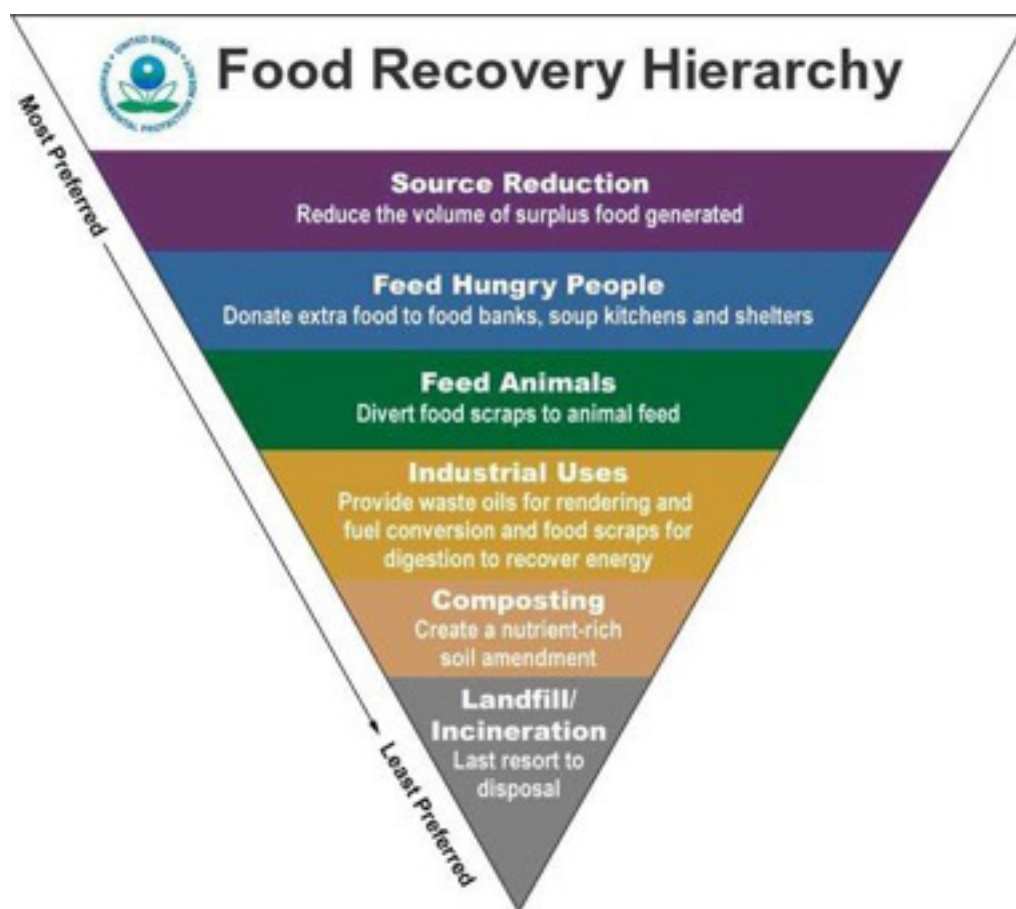
Figure 1. Food Recovery Hierarchy.