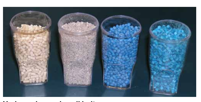
Various slug and snail baits

If you are growing potted plants on benches, or if you have fruit trees you wish to protect, physical barriers may be the most effective method of keeping your crop safe. Copper in various forms is repellent to slugs and snails, and these animals will generally avoid crossing a band that is 3–4 inches wide or greater. Copper foil can be placed around bench supports. Alternatively, bench supports or the trunks of trees can be treated with a sprayable formulation of copper such as Bordeaux mixture. The incorporation of latex paint into the mix will greatly increase the length of time that the material will stay repellent. Additional information on barriers and