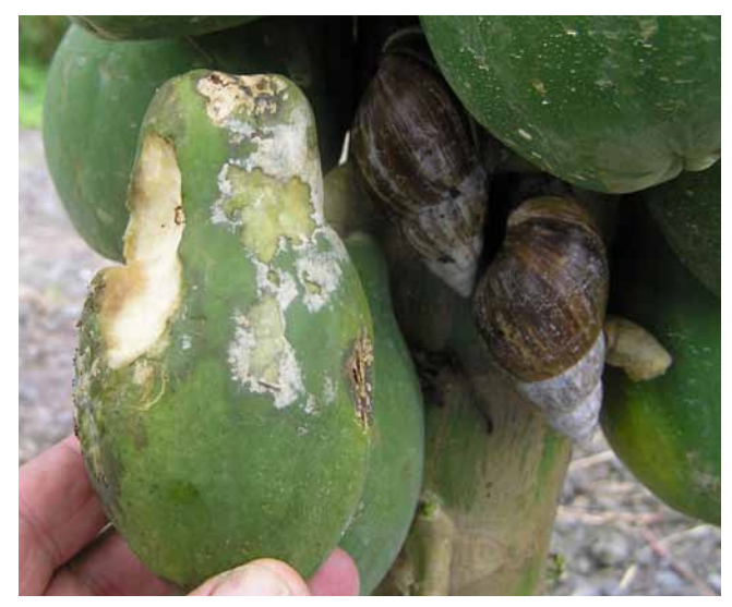
Giant African snails, and damage from their feeding [These are small ones-they can be about twice this size]