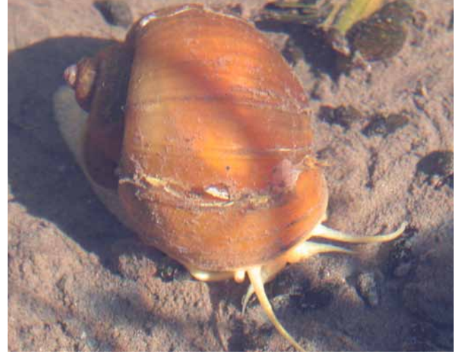
An apple snail, photographed under water [about actual size]