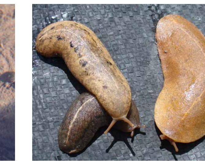
The Cuban slug comes in many colors. [about actual size]