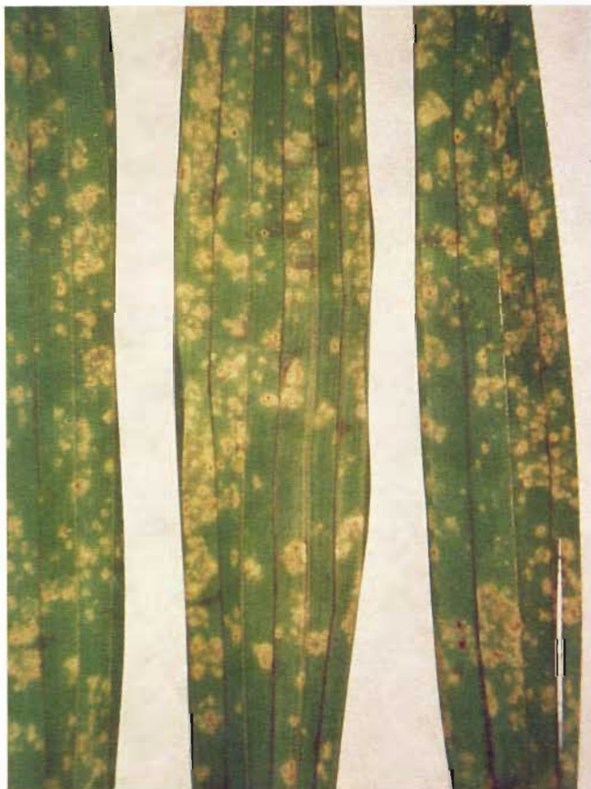
Figure 2. Close-up of leaf spots on rhapsis palm with characteristic chlorosis and mosaic leaf patterns.

removed. After a year in a glass greenhouse these plants had only clean, healthy leaves, indicating that eliminating inoculum sources and reducing free moisture on leaves will disrupt the disease cycle and effectively control the disease. For growers who cannot move plants to protective shelters of glass or solid plastic cover, removing diseased leaves and spraying with mancozeb at 2 lb per 100 gal should be useful in controlling the disease. It should be emphasized that application of mancozeb without sanitation will not be very effective and may be useless.