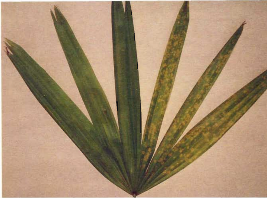
Figure 1. Reproduction of leaf spots by half-leaf inoculation.